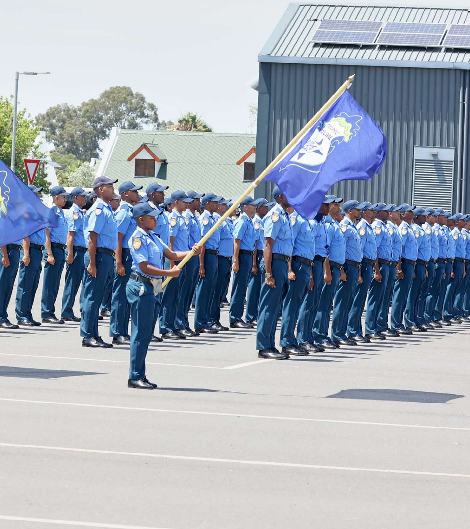
A passing-out parade for newly qualified traffic officers who successfully obtained the Further Education and Training Certificate: Road Traffic Law Enforcement.