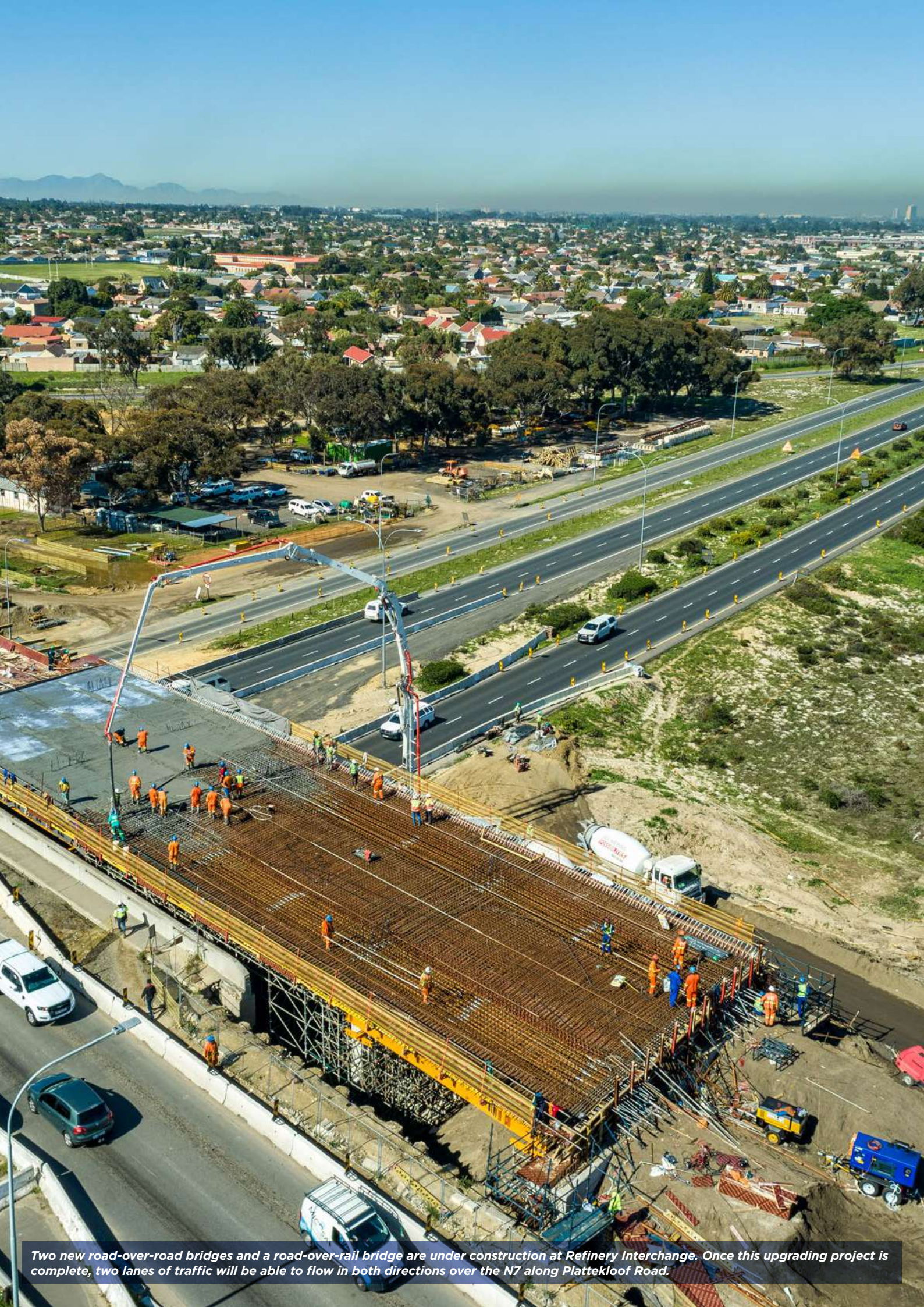
Two new road-over-road bridges and a road-over-rail bridge are under construction at Refinery Interchange. Once this upgrading project is complete, two lanes of traffic will be able to flow in both directions over the N7 along Platteklouf Road.