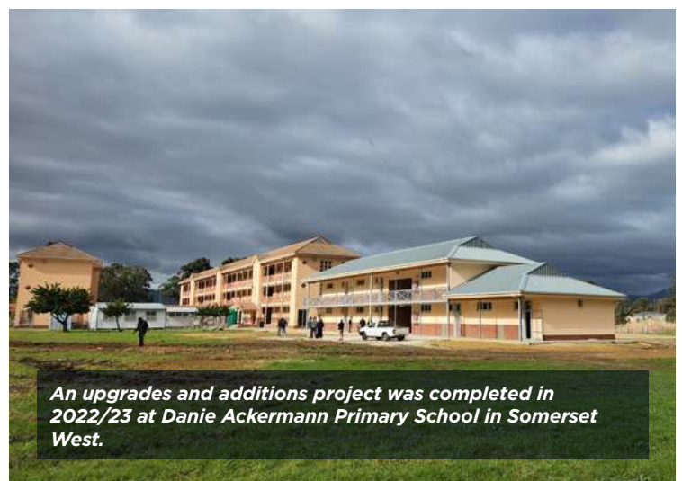
An upgrades and additions project was completed in 2022/23 at Danie Ackermann Primary School in Somerset West.

For you, the citizen, this means better access to school education opportunities.