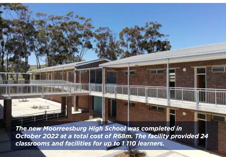
The new Moorreesburg High School was completed in October 2022 at a total cost of R68m. The facility provided 24 classrooms and facilities for up to 1 110 learners.