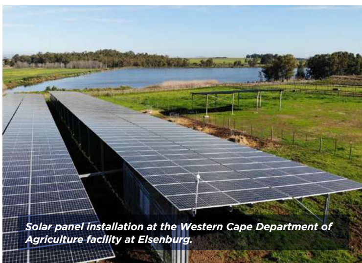
Solar panel installation at the Western Cape Department of Agriculture facility at Elsenburg.

As part of the Department's response to energy shortages, two solar photovoltaic installations were completed in the 4th Quarter of 2022/23, one covering the parking area at the Green Building offices in Bellville, and the other comprising a ground-mounted installation at Elsenburg.