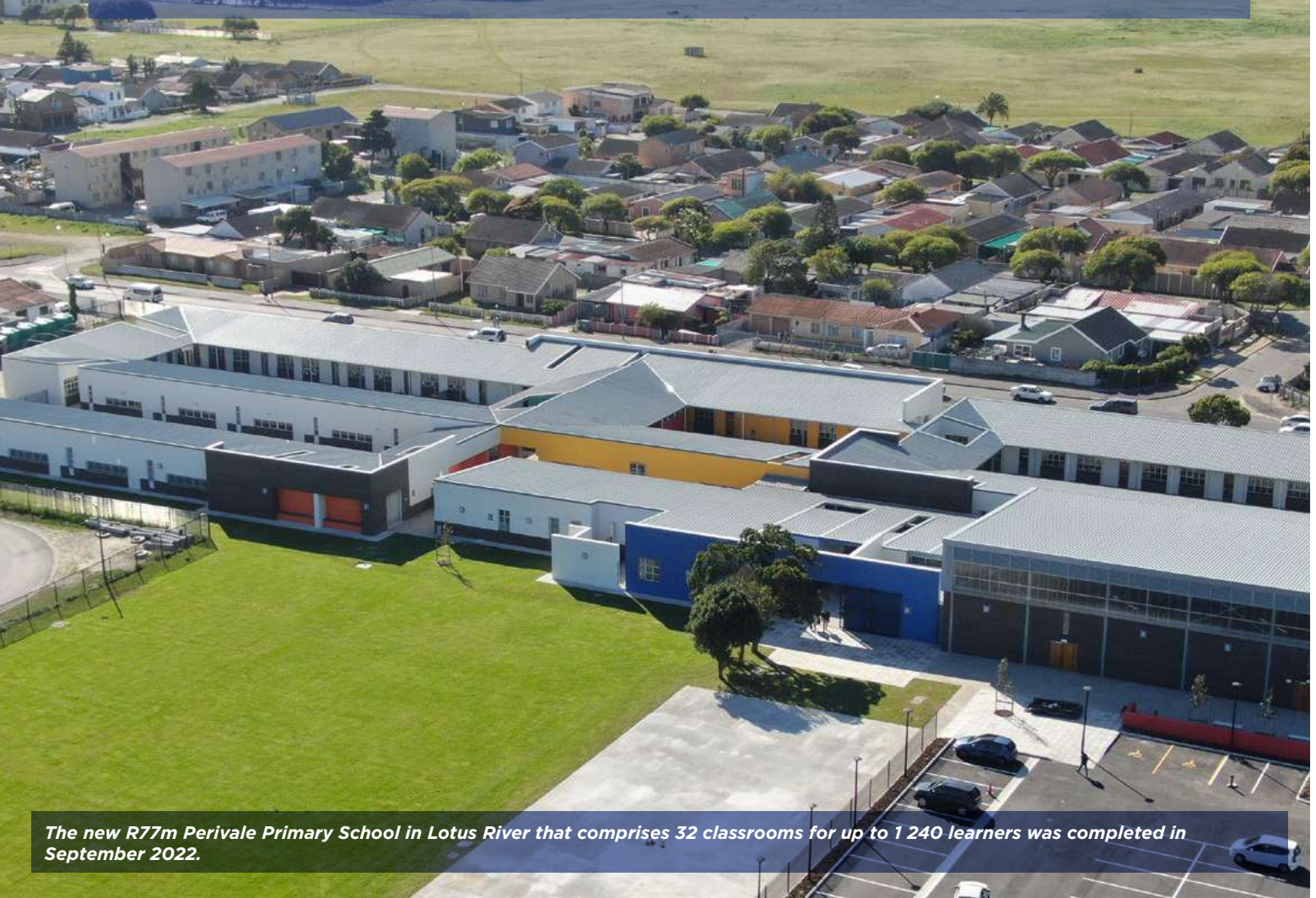
The new R77m Perivale Primary School in Lotus River that comprises 32 classrooms for up to 1 240 learners was completed in September 2022.

We are responsible for building and refurbishing school infrastructure for the Western Cape Education Department. Our infrastructure and maintenance projects provide high-quality teaching and learning facilities, and help to meet the growing demand for schooling.