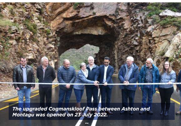
The upgraded Cogmanskloof Pass between Ashton and Montagu was opened on 23 July 2022.