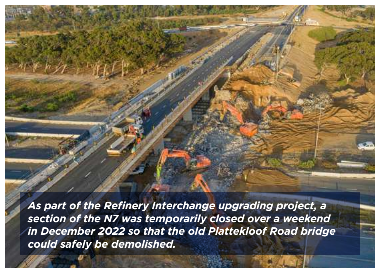
As part of the Refinery Interchange upgrading project, a section of the N7 was temporarily closed over a weekend in December 2022 so that the old Platteklouf Road bridge could safely be demolished.

For you, the citizen, this means better access to work opportunities, economic opportunities, and social amenities.