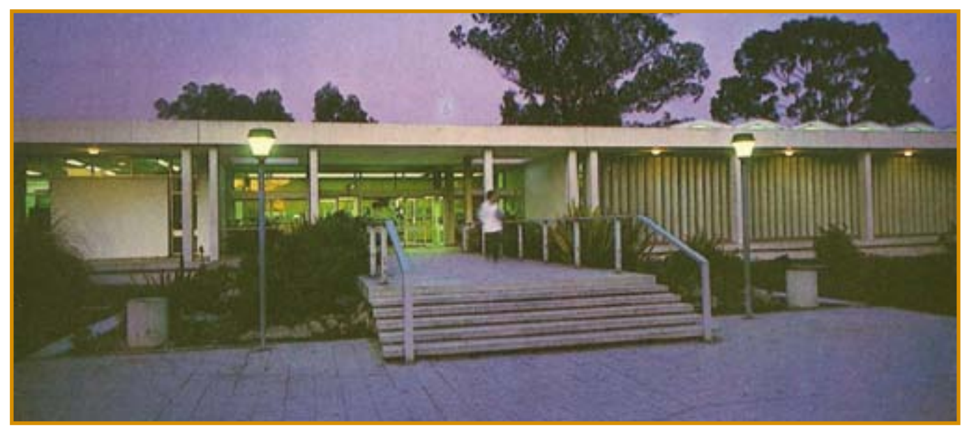
▲ Bellville Library in Coronation (later Kruskal) Avenue. A stylish building for its time, it was completed in 1964 at a cost of R190 000

A free public library service came to Bellville on 25 August 1964, with the opening of the library in Coronation (later Kruskal) Avenue, built at a cost of R190,000. It was a classic, stylish building,