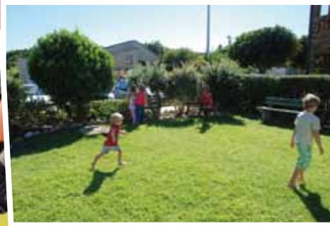
Youngsters had great fun during an Easter hunt