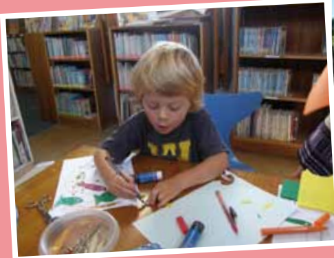
Some serious concentration was required to make these summer placemats . . .