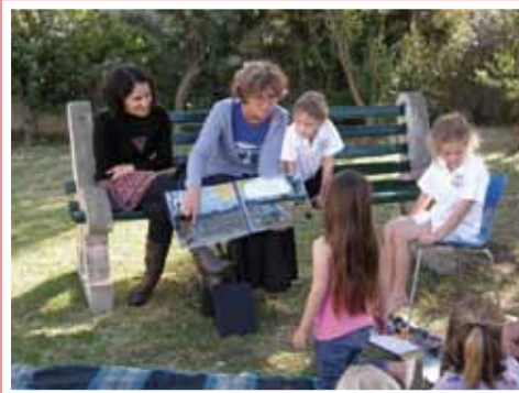
Children listening attentively during a storyreading by an author

Kommetjie Library is always a hive of activity. Some of the activities presented lately included the making of placemats and Christmas crackers, an Easter hunt, a talk by an author and illustrator as well as storytelling sessions.