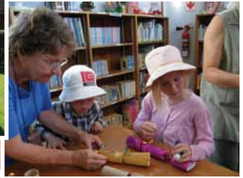
Make your own Christmas crackers and save money

Kommetjie Library is always a hive of activity. Some of the activities presented lately included the making of placemats and Christmas crackers, an Easter hunt, a talk by an author and illustrator as well as storytelling sessions.