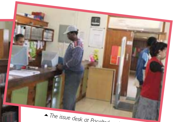
▲ The issue desk at Pacaltdorp Library