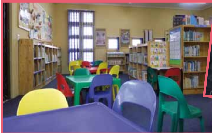
◀ The colourful children's section at Kurland Library