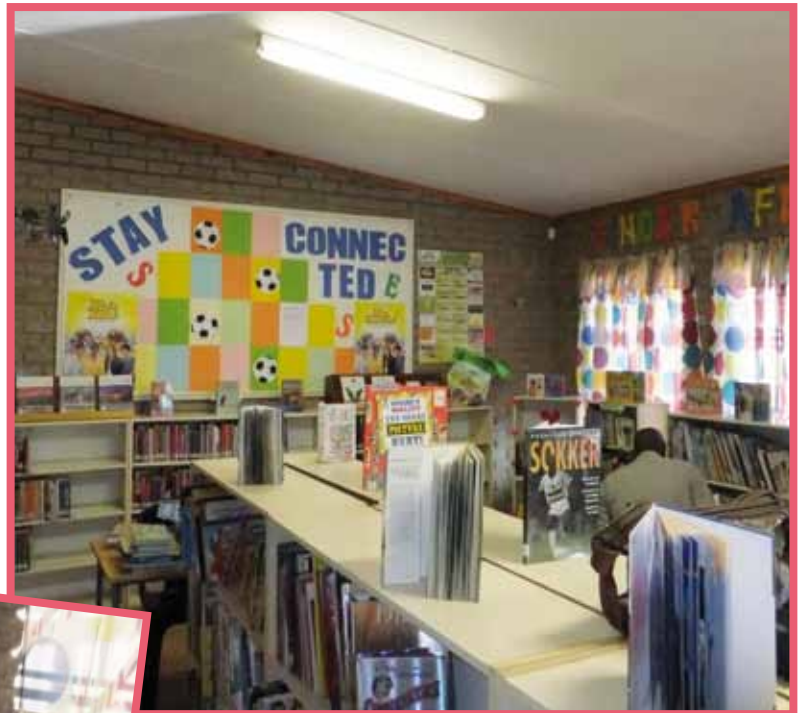
▲ Waboomskraal Library was officially opened in March this year