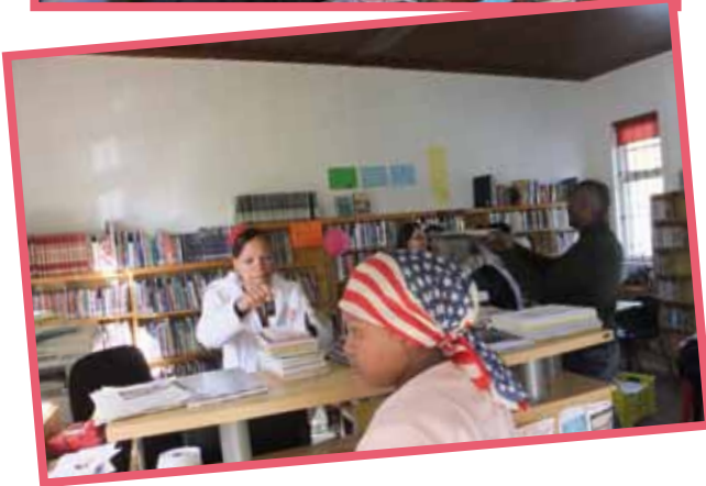
▲ A very busy Wittedrif Library