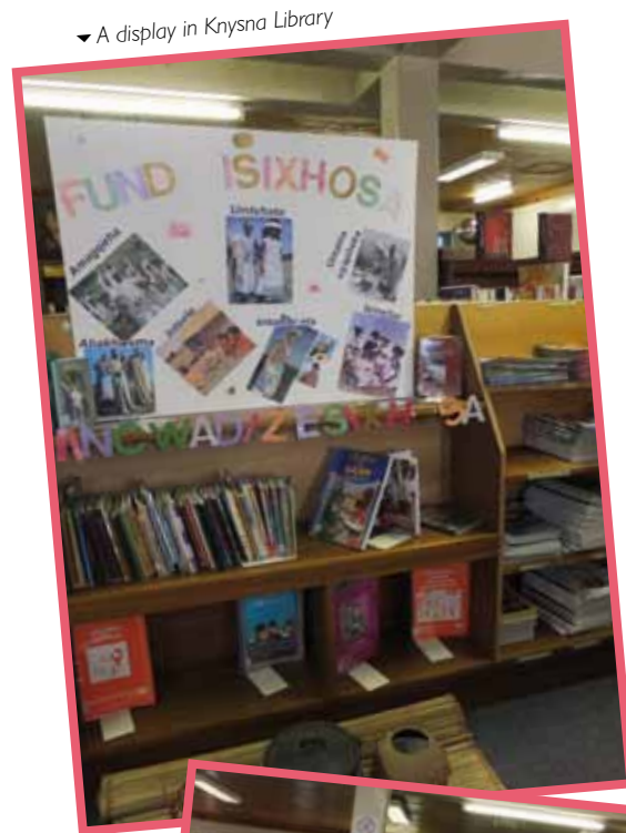
▼ A display in Knysna Library