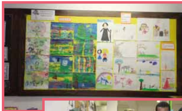
◀ Children's art in Plettenberg Bay Library