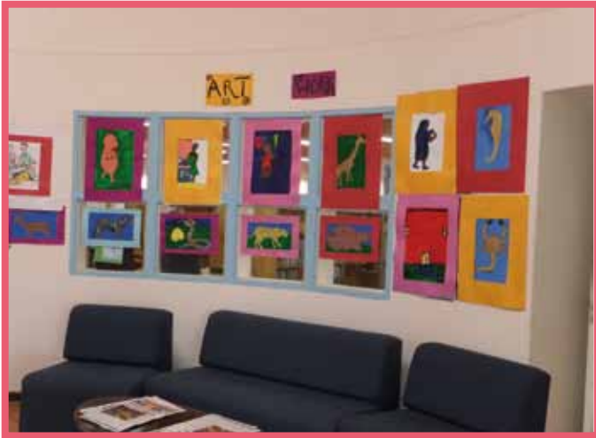
▲ Kwanokuthula Library's colourful art exhibition