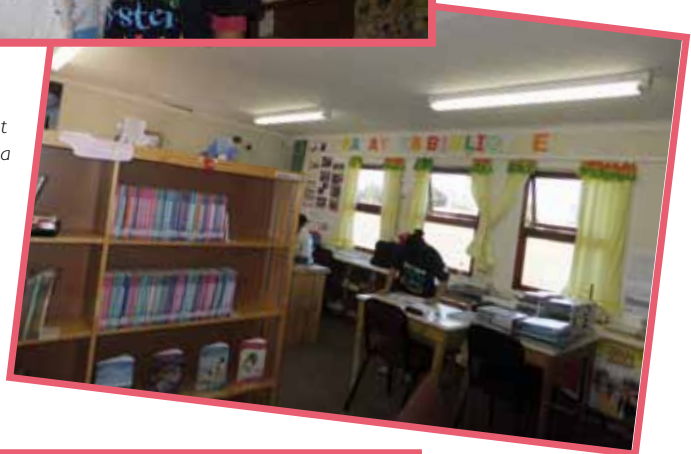
▶ Karatara Depot is open 20 hours a week