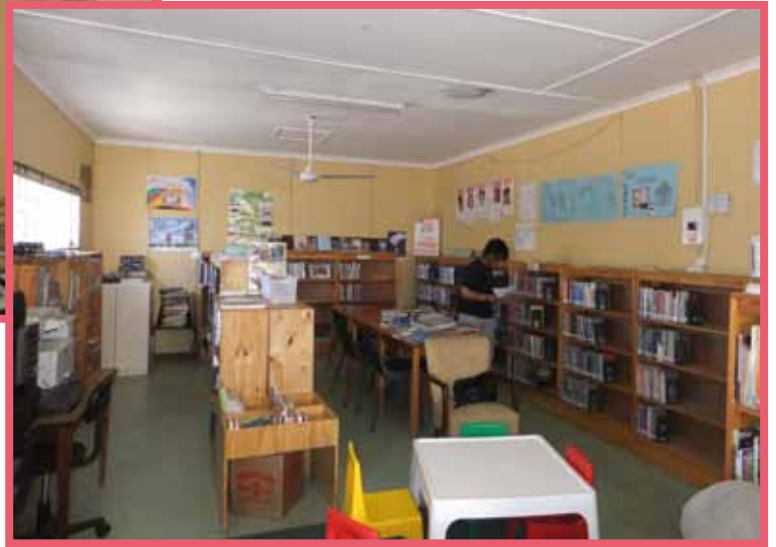
▲ Colourful chairs attract children to read at Touwsrante Library