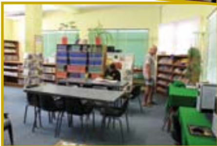
▲ A comfortable study area, a well-stocked magazine collection and access to computers ensure that users make good use of the facilities at Touwsriver Library