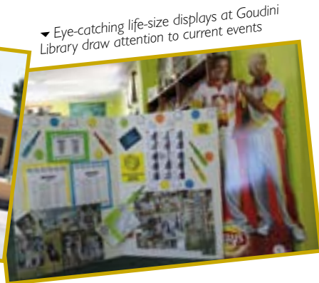
▼ Eye-catching life-size displays at Goudini Library draw attention to current events