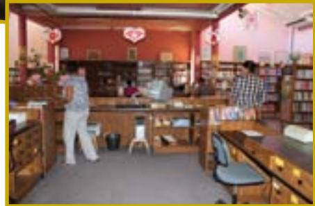
▼ Neatly stacked and clearly marked shelves in a well-designed space make for easy browsing in Steenvliet Library