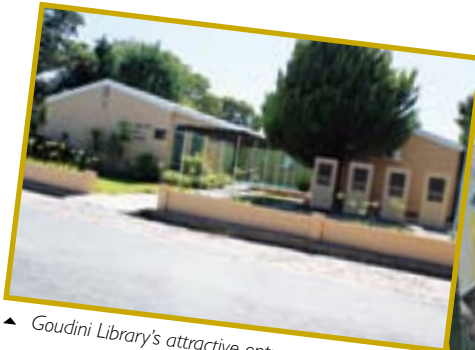
▲ Goudini Library's attractive entrance