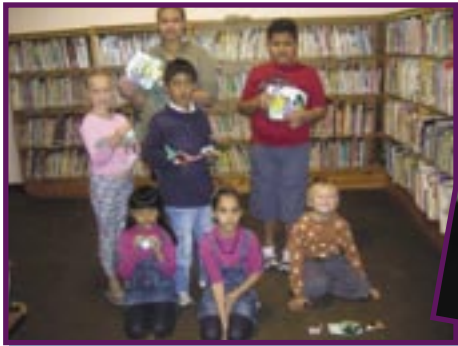
↻ Displaying the origami butterflies, frogs on a lily pad and dog card