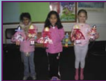
↻ The old-lady-who-swallowed-a-fly craft

bug, spider, and a bat. Then there was the making of a craft card and the old-woman-who-swallowed-a-fly craft activity.