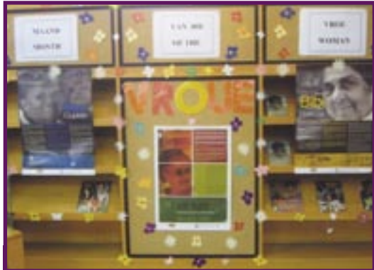
↪ Vrouemaand (Augustus 2009) het groot aftrek in Worcester Biblioteek gekry