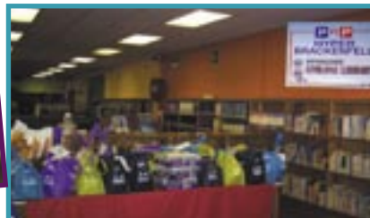
↻ Wonderful prizes were donated, some of which can be seen here