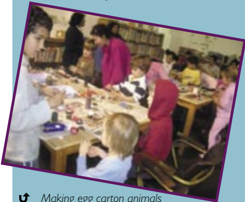
↻ Making egg carton animals