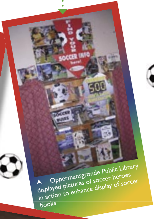
▲ Oppermansgronde Public Library displayed pictures of soccer heroes in action to enhance display of soccer books