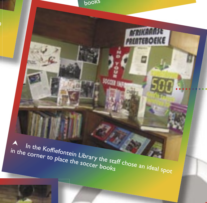
▲ In the Koffiefontein Library the staff chose an ideal spot in the corner to place the soccer books