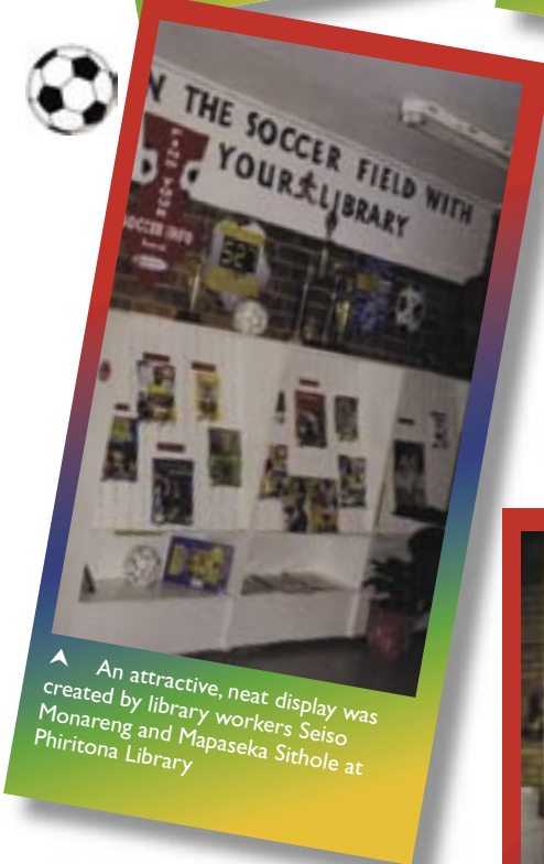
▲ An attractive, neat display was created by library workers Seiso Monareng and Mapaseka Sithole at Phiritona Library