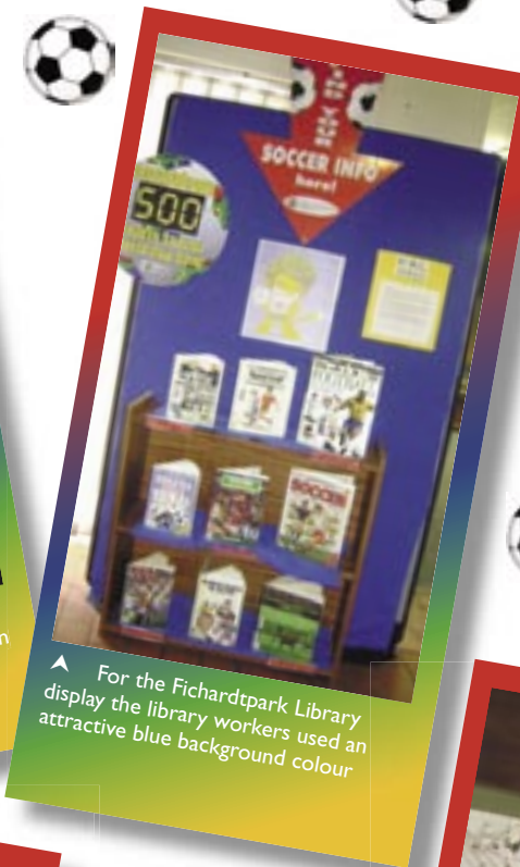
▲ For the Fichardtspark Library display the library workers used an attractive blue background colour