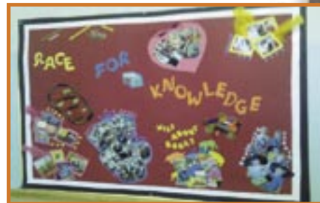
△ A colourful Library Week poster