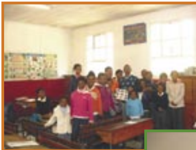
△ Leerders van Oakhurst Primer tydens 'n bemarkings- besoek aan die skool