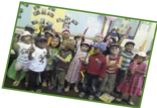
▷ Little ones displaying their handmade book-marks

At Rondebosch Library an attractive collage for Library Week was produced as well as personalised bookmarks that were made by kids with their initials written in bubble writing on top. Bookmarks will always come in handy, whether you enjoy fairytales or mysteries.