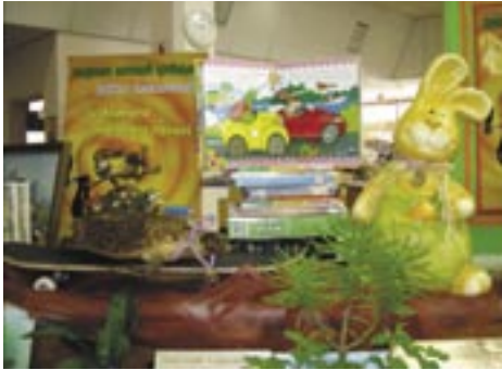
▲ A colourful display at Edgemoed Library