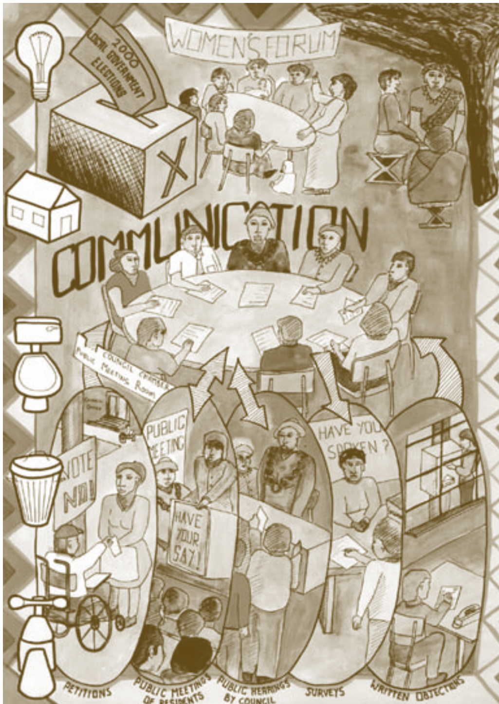
Illustration © EISA

The 2004/2005 National Ward Committee Survey highlighted effective communication and interaction between the ward committee, municipal council and the community as one of the main challenges of the ward committee system. Less than half the respondents in the survey were able to affirm that ward committees do, in fact, impact on council decisions. For the ward committee to fulfil its core function of being a link between the municipality and its communities, there has to be a structured way of communicating .