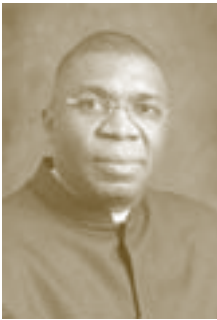
Mr F.S. Mufamadi

Minister for Provincial and Local Government