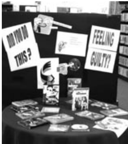
Una Engelbrecht, bibliotekaris van Paarl Biblioteek, stuur vir ons hierdie foto oor 'n uitstalling oor die korrekte sorg van DVD's