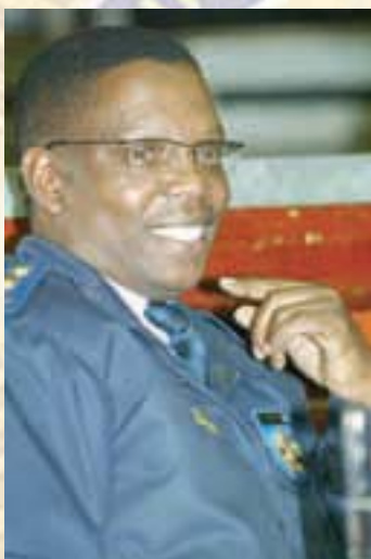
Provincial Commissioner Mzwandile Petros

Fundamental to turning the tide against crime in the Western Cape is the People-Orientated Sustainable Strategy(POSS) of SAPS. The POSS re-orientates policing around the major crimes which includes murder, attempted murder, rape, robbery aggravated, firearms and drug-related crimes.