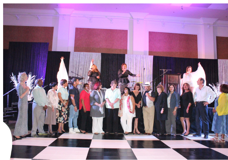
Above: Some of the cast of Suidooster with the 40 year recipients listening attentively to the Broads on Broadway