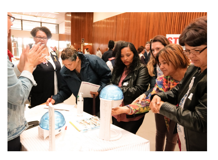
Above: Attendees trying out the disinfecting machine for their hands