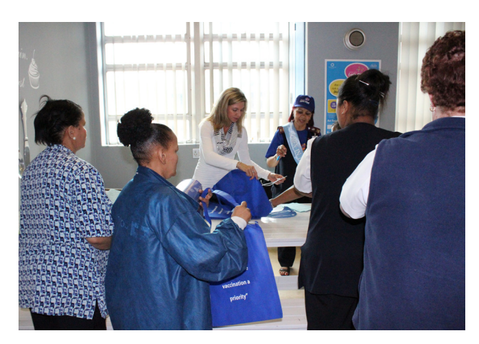
Above: Staff could not wait to get their freebies

The theme for World Diabetes Day 2017 was Women in Diabetes. Seeing many women that suffer the consequences of preventable diseases at Tygerberg hospital inspired the local organising committee to use this opportunity to promote health in our staff members with a specific focus on the bulk of employees- our women. Staff members deserve to be well informed on the risk factors for diabetes and empowered with the strategies in order to prevent the disease. They may in fact become change agents as they are role models for not only their families but their communities. The event was attended by more than 400 staff members. The nursing staff of the paediatric division won the clinical unit with 51 attendees, followed by internal medicine (including subspecialties) 48 attendees and surgery with 39 attendees. The non-clinical units were best represented by admin (70 attendees) and cleaning staff. The most outstanding result though were to see how well women can work together to empower other women. Dr Ankia Coetzee