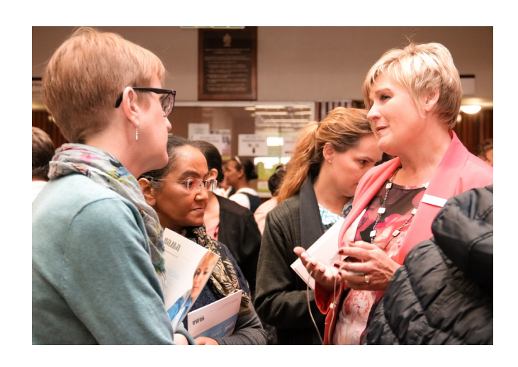
Above: Attendeed interacting with one another