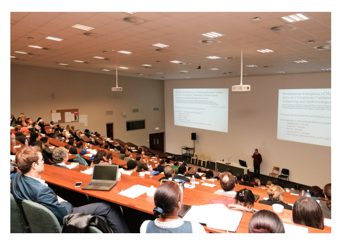
Above: Attendees listening to the presenter