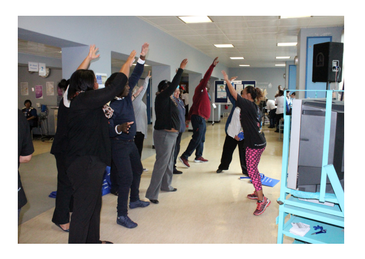
Above: Staff was also given some exercises