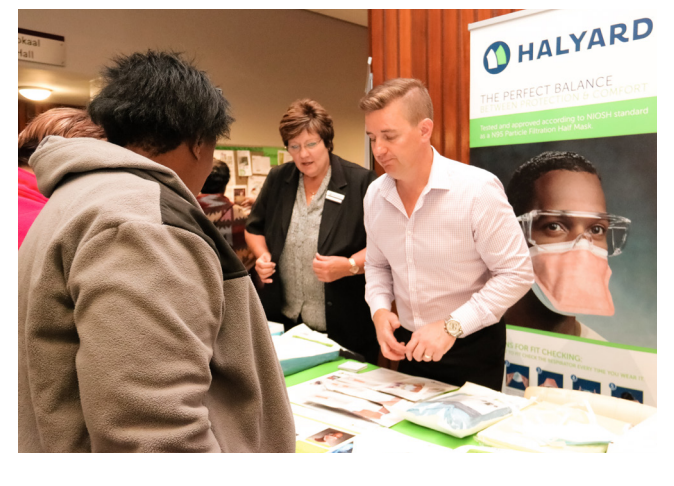
Above: Attendees could visit different exhibition stalls