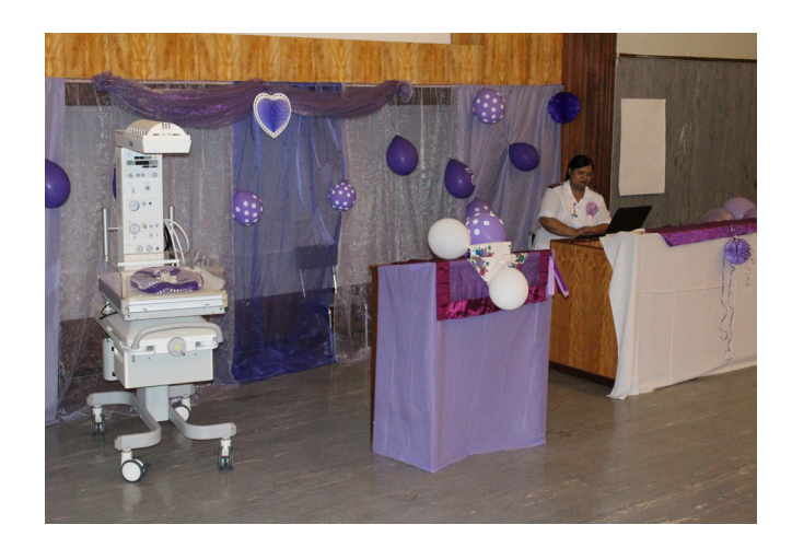
Above: The venue was beautifully decorated in purple

On 17th November the Paediatrics Department celebrated International Preemie Day. The day started with the paediatric staff meeting, the greeting of patients, visitors and colleagues at the hospital entrances, sharing information pertaining to Preemie Day and the blowing of bubbles. A formal program was held at the R4 Lecture Room where the mothers of the premature babies shared their personal journey with other mothers, staff and visitors. The highlight of the event was the handing out of knitted baby blankets, clothing, beanies, socks, toiletries, cupcakes, lunch and juice to the patients and their mothers. A huge thank you to the various stakeholders who contributed to the overall success of the day.