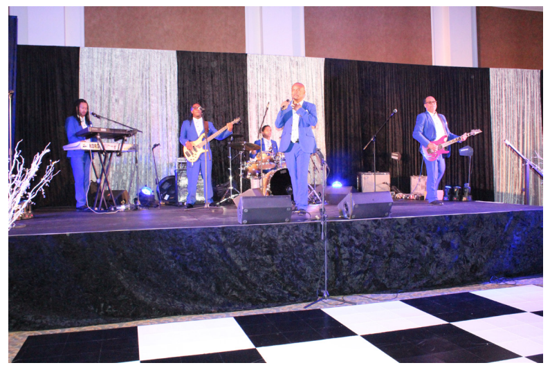
Above: The Rockets had the crowd singing along to old medleys