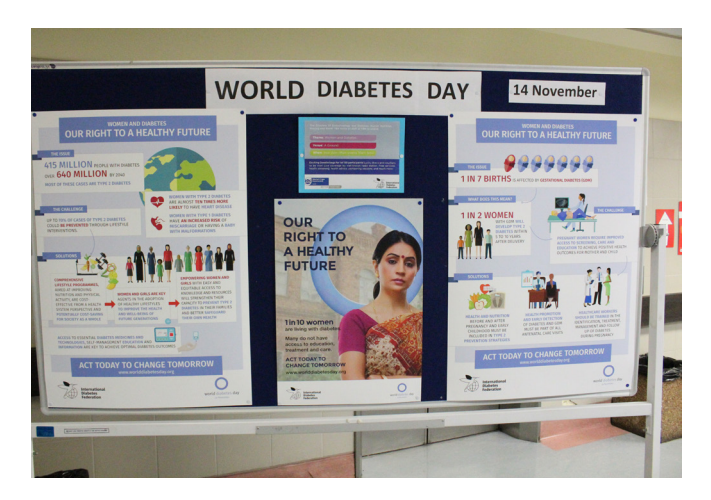
Above: Exhibition Board