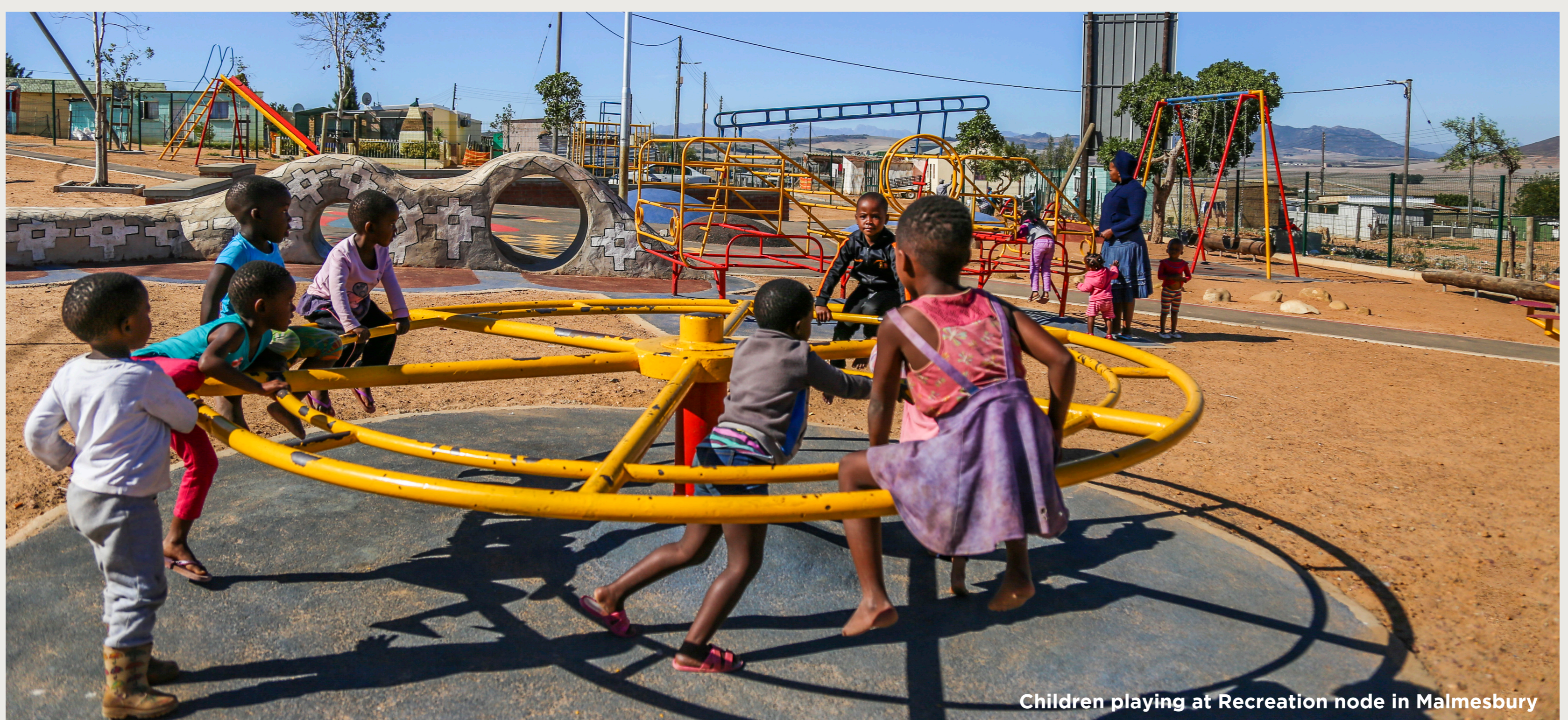
Children playing at Recreation node in Malmesbury