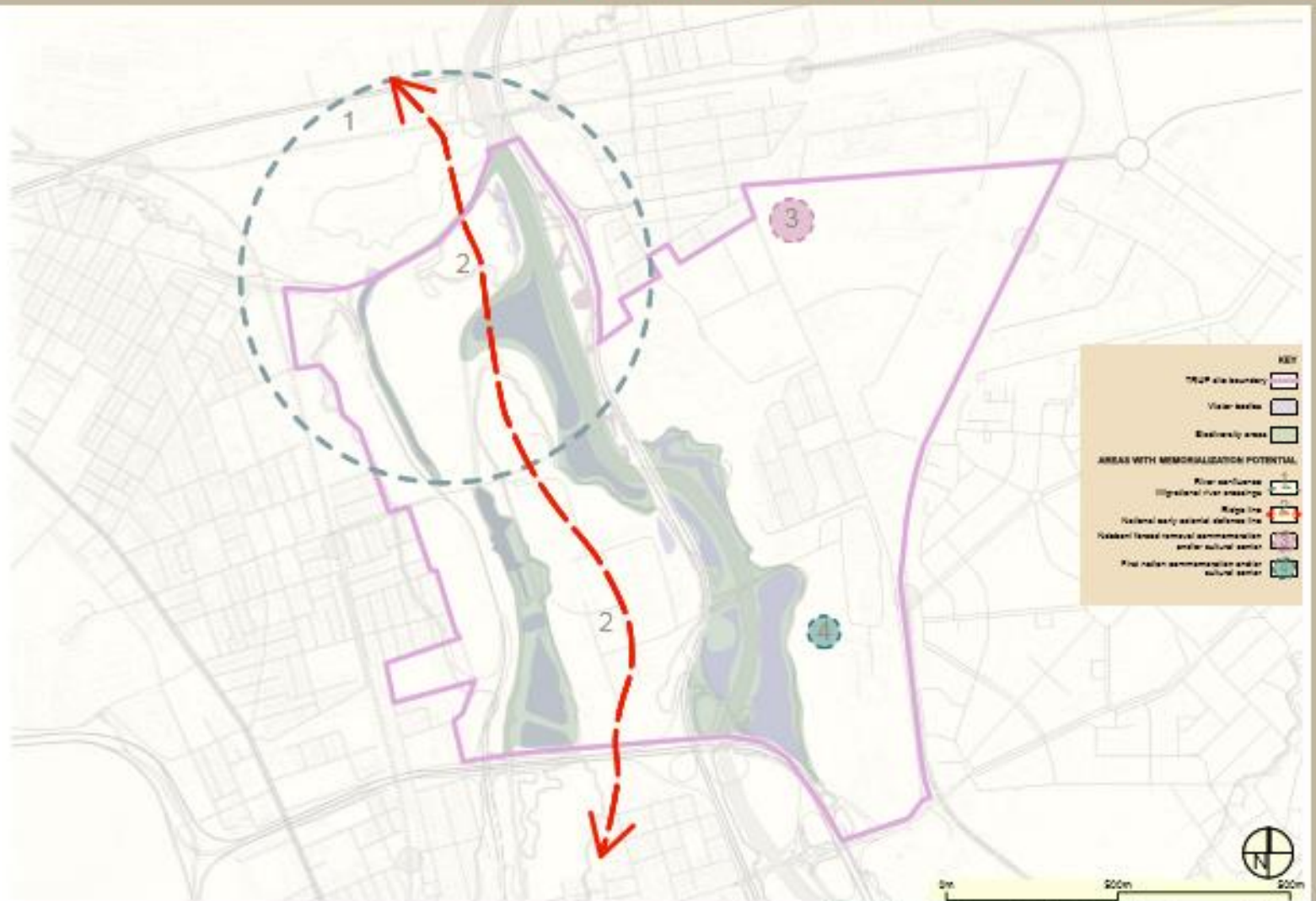
POTENTIAL COMMEMORATIVE SITES & CULTURAL CENTRES DIAGRAM 06