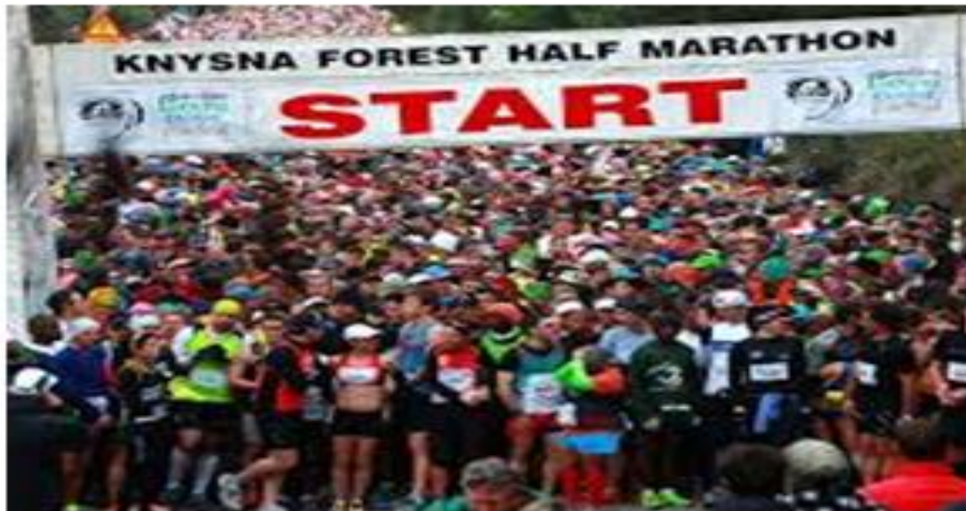
Knysna Oyster Festival – Opening of the Half Marathon