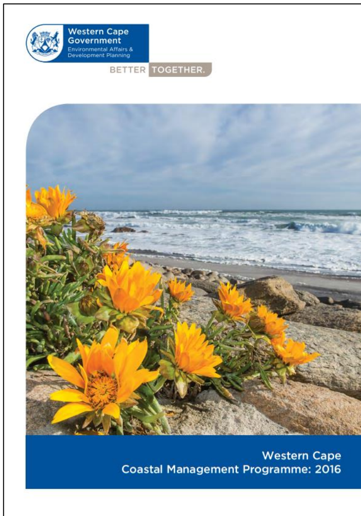
Figure 4: Western Cape Coastal Management Programme (2016)