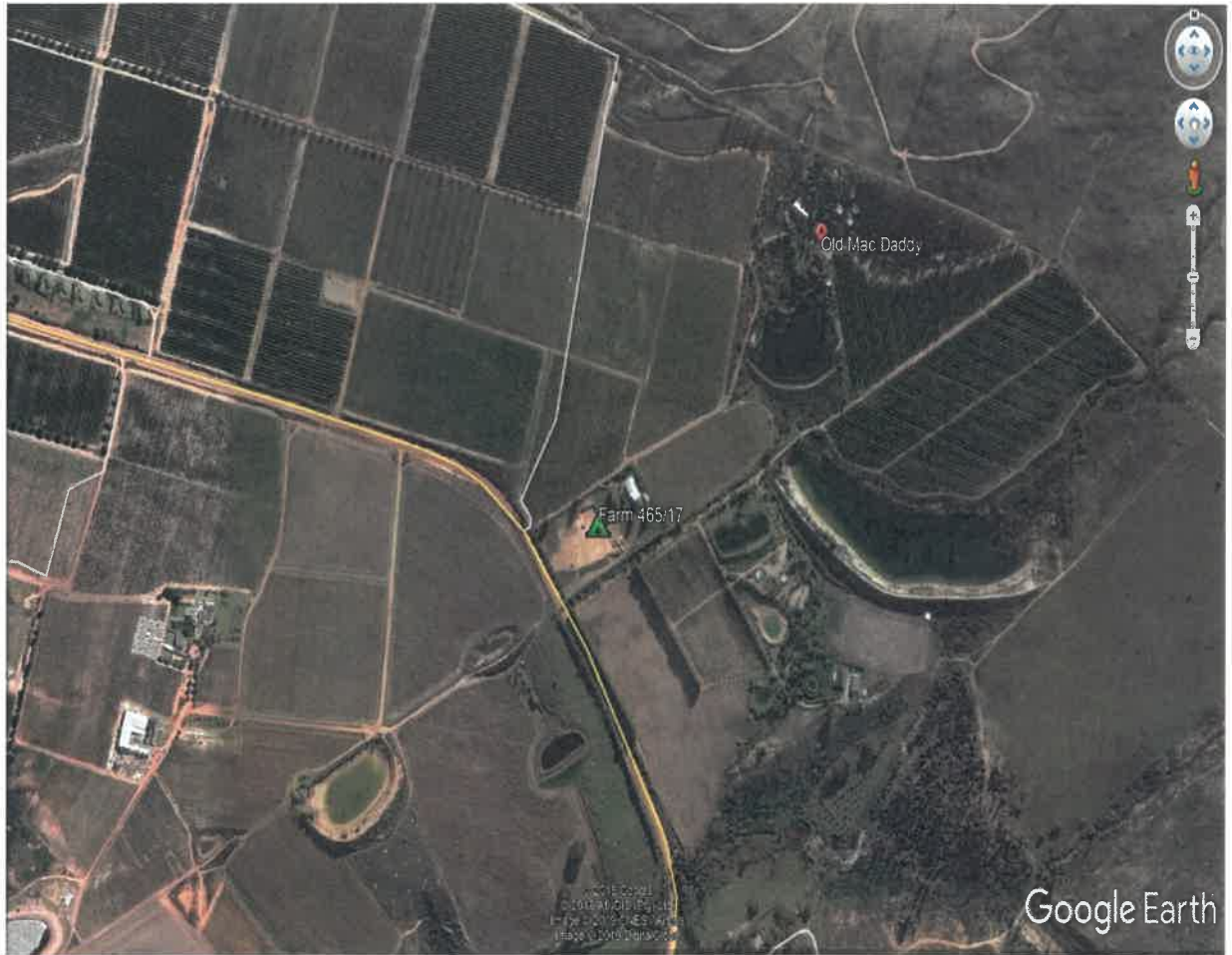
Figure 1: Locality map depicting the location of the site where the tourist facilities will be located.