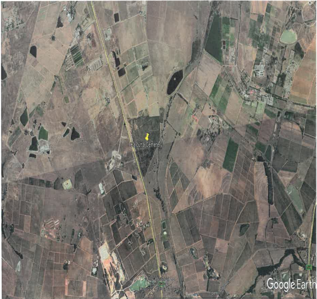
Figure 1: Locality map.