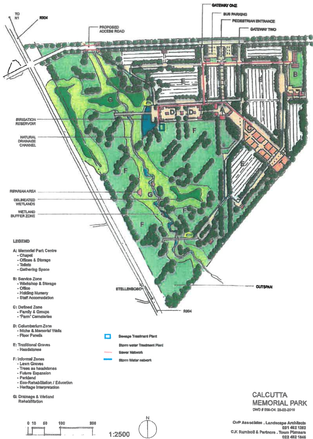
Figure 3: Storm water and sewage plan layout.