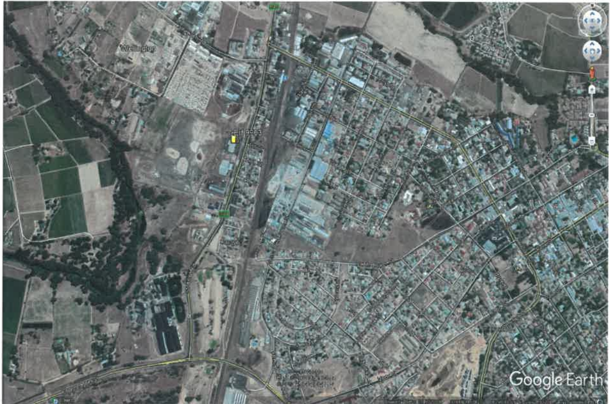
Figure 1: Locality map depicting the site on Erf No. 9903.