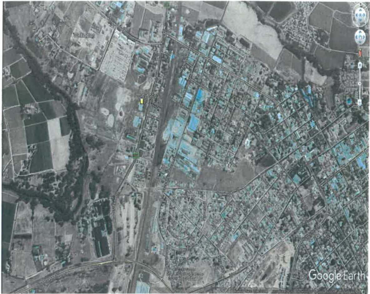
Figure 1: Locality map depicting the site on Erf No. 9903.