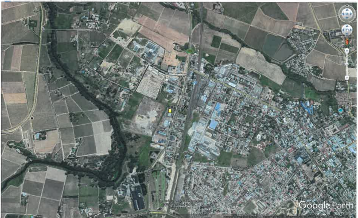
Figure 1: Locality map depicting the site on Erf No. 14992 (a portion of Erf No. 9903), Wellington.