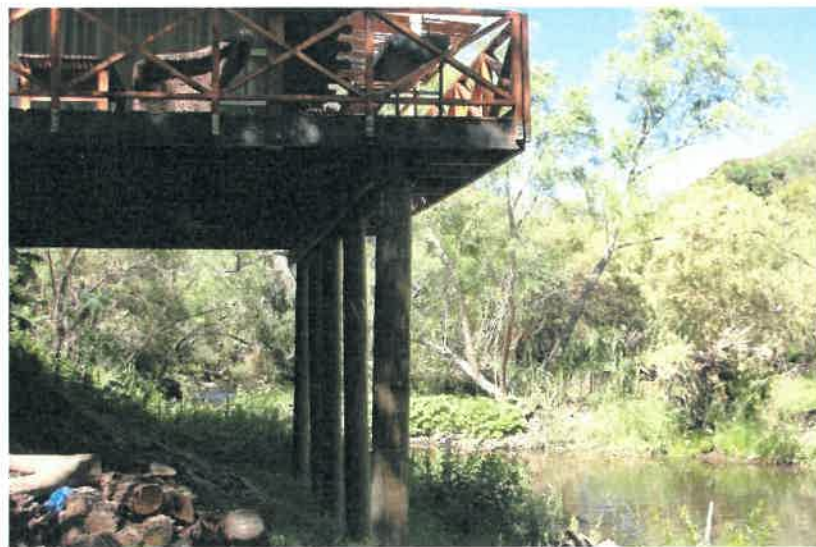
Photo 1: Development of a wooden structure within 32m of a watercourse.