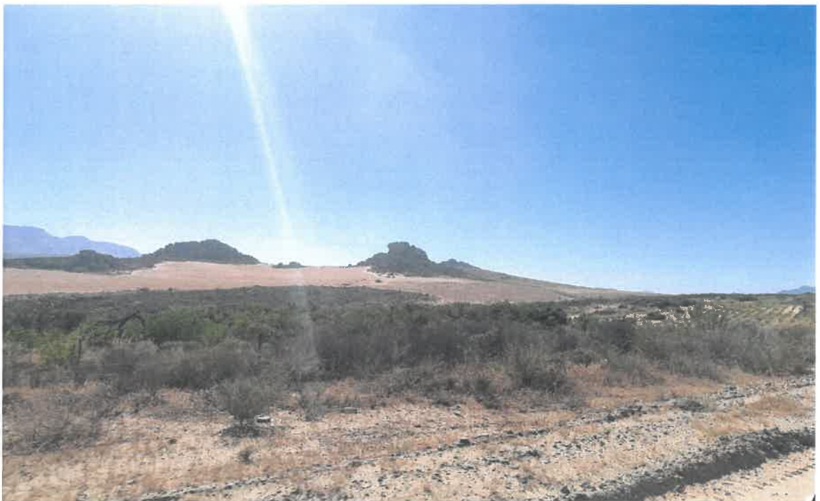
Photo 1: Approximately 144 hectares of indigenous vegetation had been cleared for agricultural purposes.