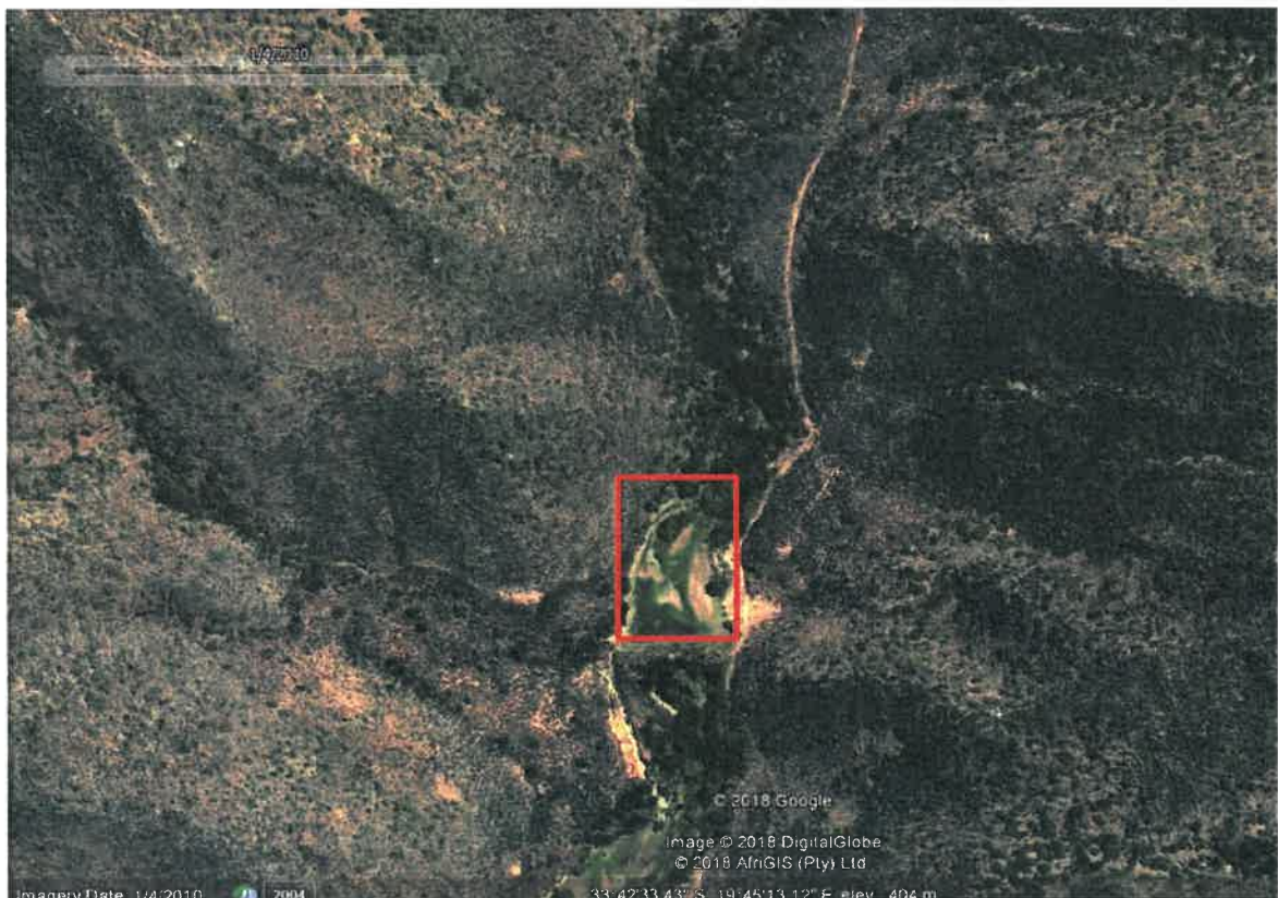
Aerial map 1: Location of alleged illegal activities demarcated in red (image dated 2010).