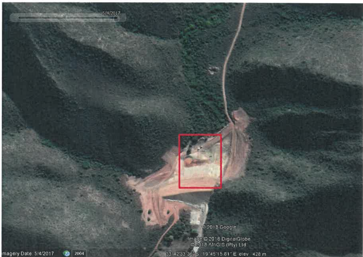
Aerial map 3: Location of alleged illegal activities demarcated in red (image dated 2017).