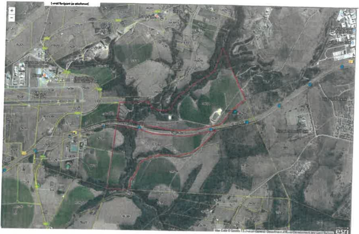
Aerial map: Location of alleged illegal activity.

GPS coordinates: S34° '00'28.6."; E22° 23' 56.0"