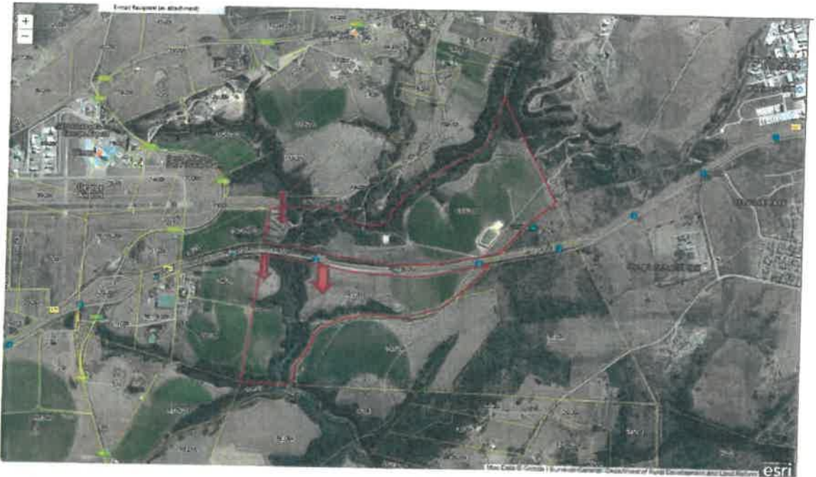
Photo 1: Image view of the cleared lands on farm portion 147 and 148/208, George