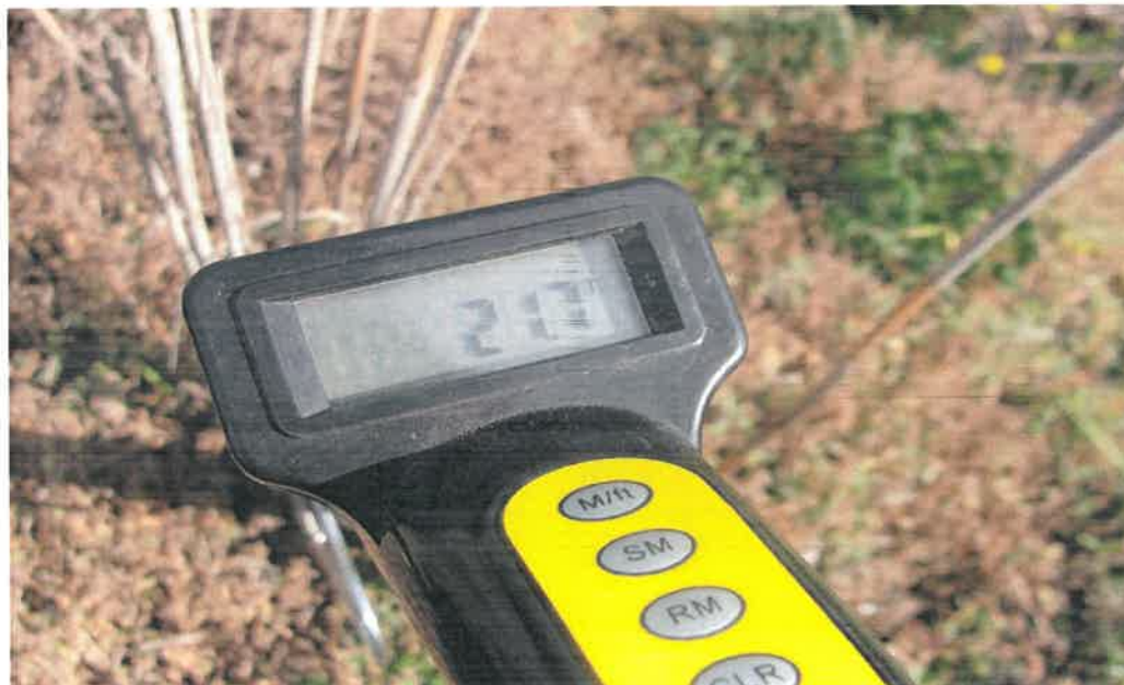
Photo 3: Image showing the distance of construction from the river.