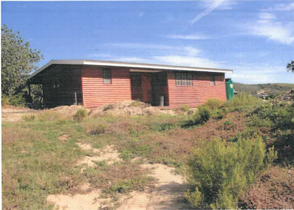
Photo 2: Image illustrating the clearance to construct the building