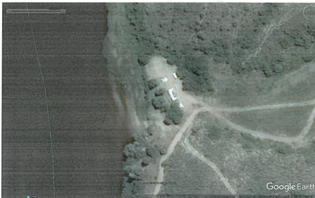
Aerial map: Location of alleged illegal activity in relation to the estuary.