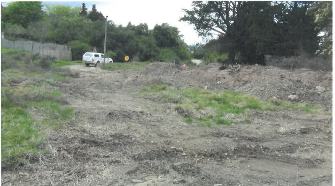
Photo 3: View towards the gravel road with the amount of infill material visible on the property.