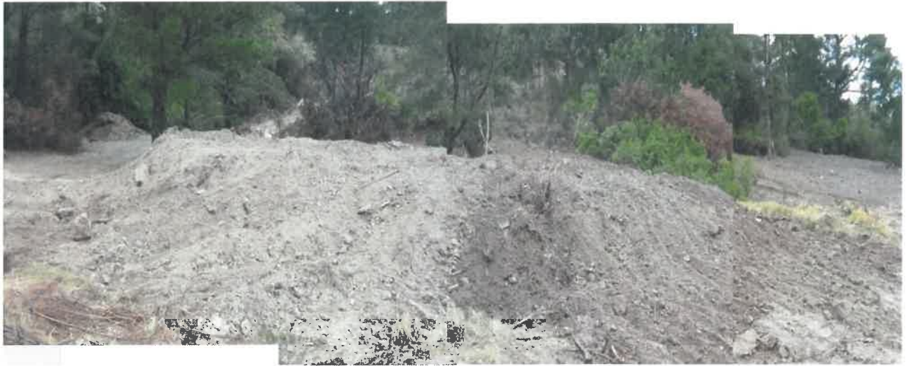
Photo 2: View of material brought onto the property for the construction of an earth berm, landscaping, etc. - believed that more than 300m 2 endangered vegetation is eliminated on the property with the infilling.