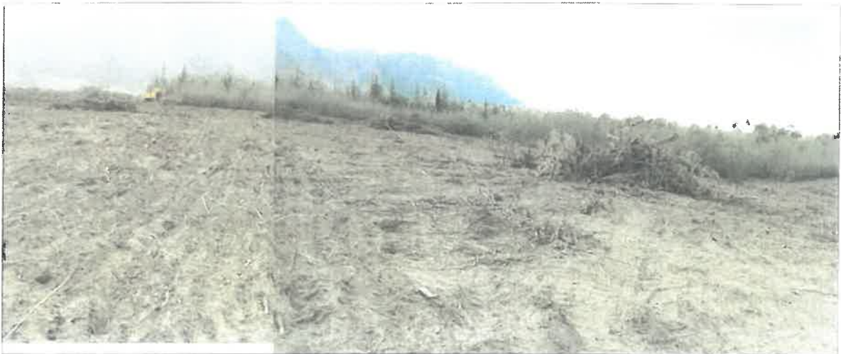
Photo 3: Vegetation clearing undertaken on the property with a bulldozer.