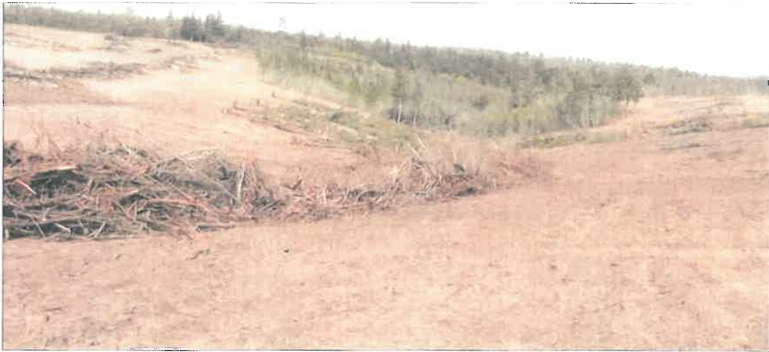
Photo 1: Vegetation clearing and movement of soil through a stream (area that can periodically hold water) on the property.