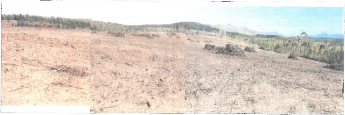
Photo 4: Vegetation clearing undertaken on the property and plant material placed on heaps for burning.