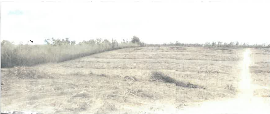
Photo 2: Vegetation clearing and movement of soil through the same stream higher up on the property.