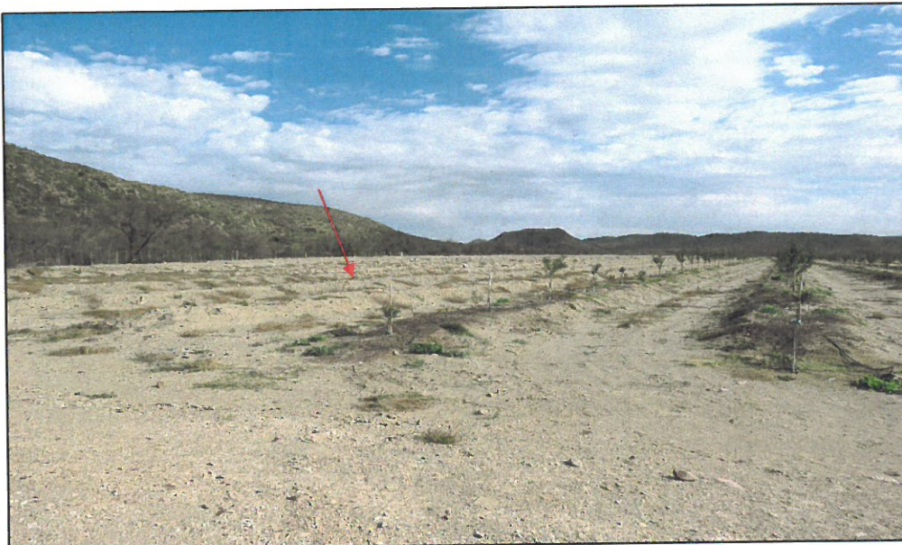
Photo 5: View of initial cleared area in extend of 1 ha occurring on the property.