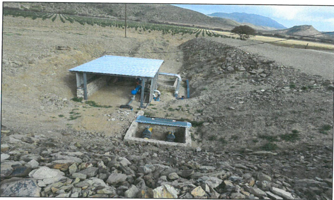
Photo 3: View of the development of a pump house adjacent to the dam wall on the property.