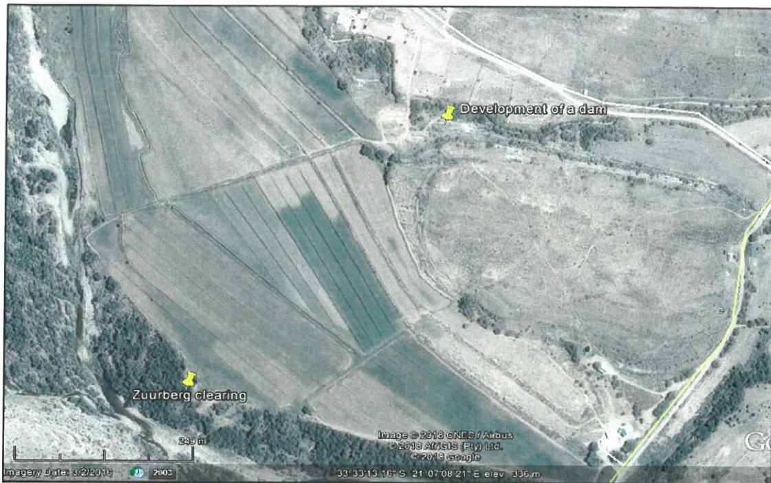
Map 1: Location of the alleged unlawful activities conducted on the property.