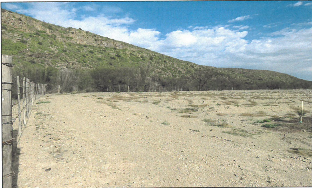
Photo 1: Development of a soil and rock embankment infrastructure within 32 metres of the Groot River.

(c) if no development setback exists, within 32 metres of a watercourse, measured from the edge of a watercourse