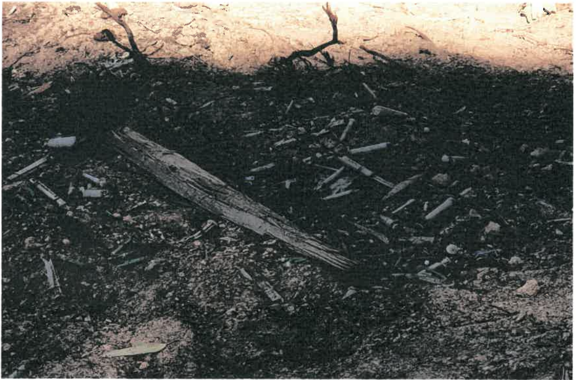
Photograph 2: Medical waste has surfaced after excavating the area intended for constructing a parking-bay.