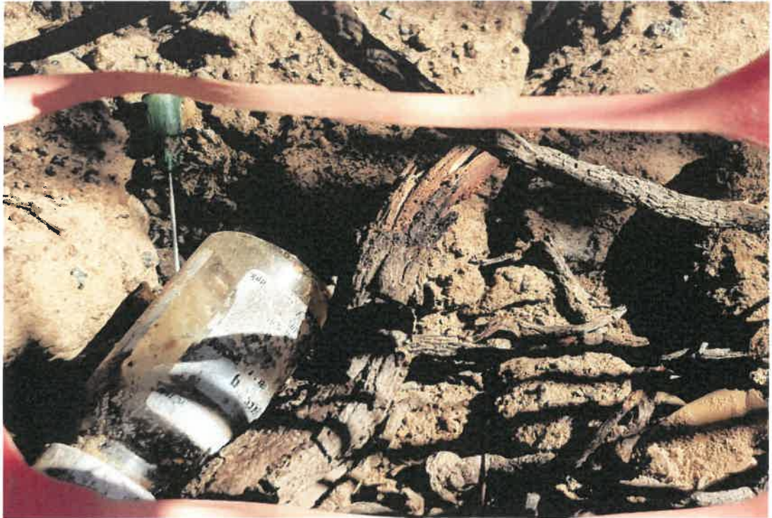
Photograph 4: Close-up view of the medical waste.