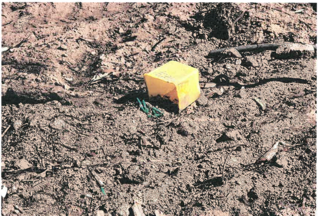
Photograph 3: Sharps container containing sharps/ syringes surfaced after excavation took place.