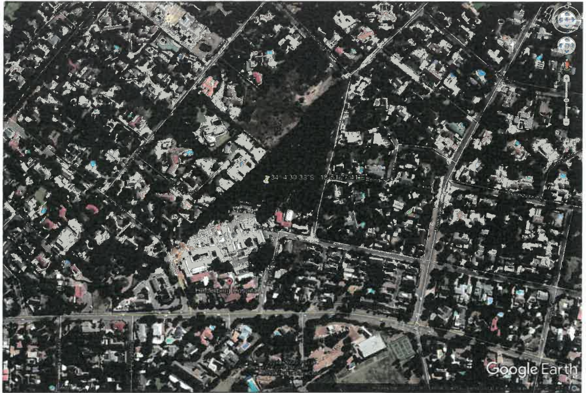
Aerial Image 1: Location and coordinates of the alleged illegal activity (34° 4'30.33\"/>