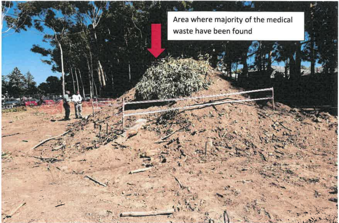
Photograph 1: Area fenced off by the hospital containing medical waste dumping.