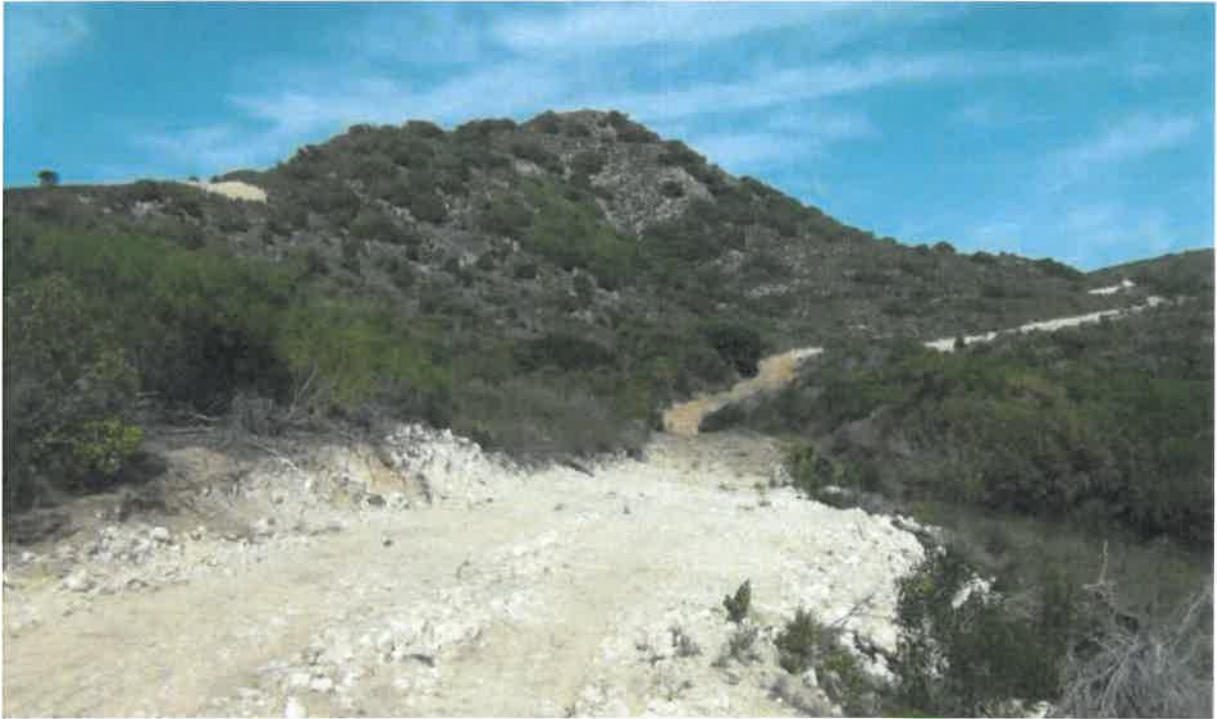
Photo 1: View of the clearing of vegetation and road construction.