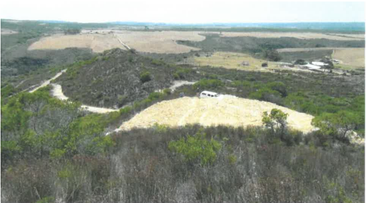
Photo2: View of the cleared vegetation and excavation of soil