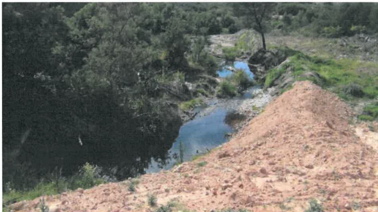
Photo3: Close view of the berm within the Goukou River