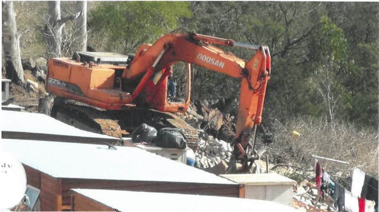
Photo 4: View of the excavator working on the temporary housing area (site 2 on Erf 214) prior to approval / permission granted in terms of the Rehabilitation Plan.

slope below the temporary housing area on site 2 of Erf 214, Knysna, without the requisite OSCA approval or an approved Rehabilitation Plan.