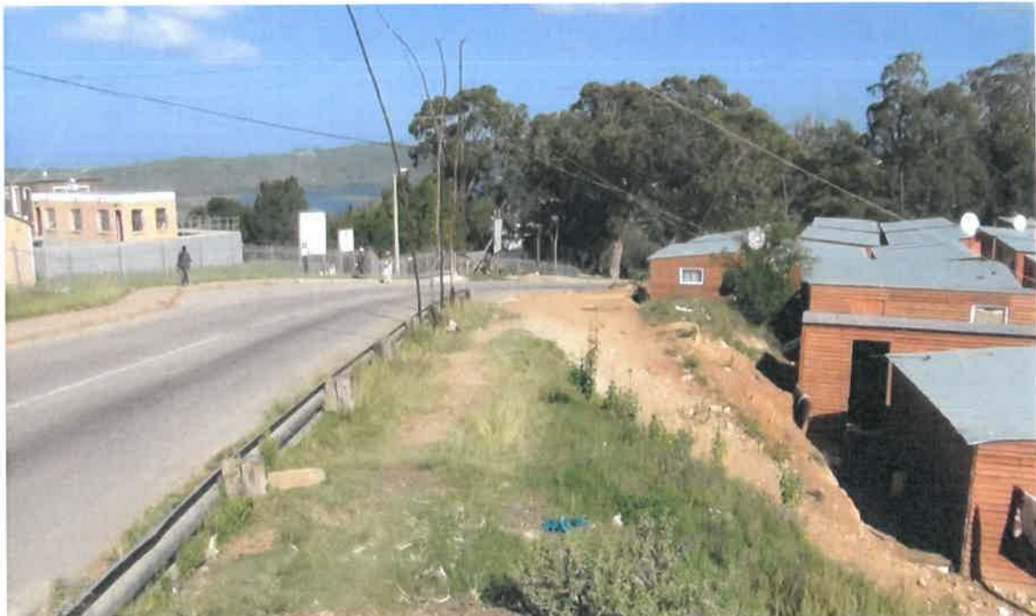
Photo 6: View of the illegal electrical / power line connections crossing the road and being supported on branches to the temporary housing area (site 2 on Erf 214).