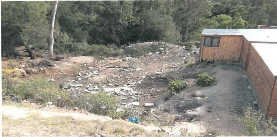
Photo 2: View of waste next to and around temporary housing area (site 1 on Erf 214).