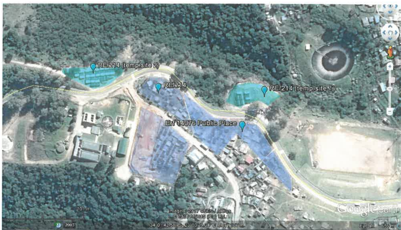
Aerial map 1: Locations of the alleged illegal vegetation clearing and earthworks on Erf 214 and Erf 14076 on the “Bloemfontein” development, Knysna (refer to the non-compliance with ECA).