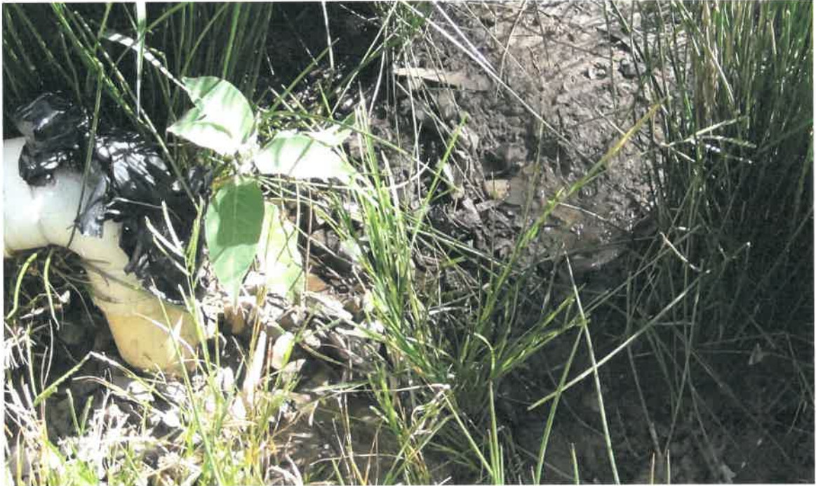
Photo 5: View of the pipes inadequately covered with plastic to prevent leakage of waste water from ablution facilities provided on the temporary housing area (site 1 on Erf 214).