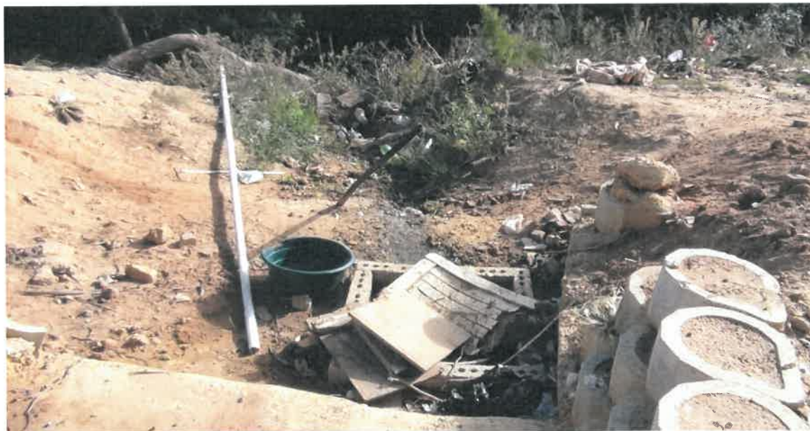
Photo 3: View of septic tank overflow on temporary housing area (site 2 on Erf 214) causing pollution.