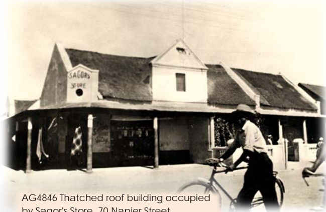
AG4846 Thatched roof building occupied by Sagor's Store, 70 Napier Street, Worcester, January 1946