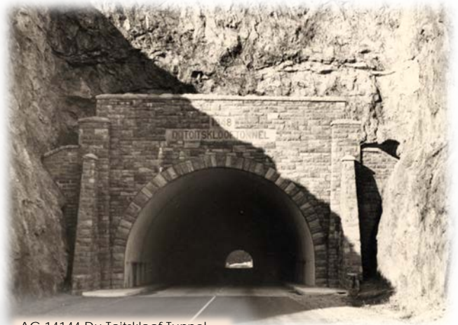
AG 14144 Du Toitskloof Tunnel near Worcester, Built in 1948