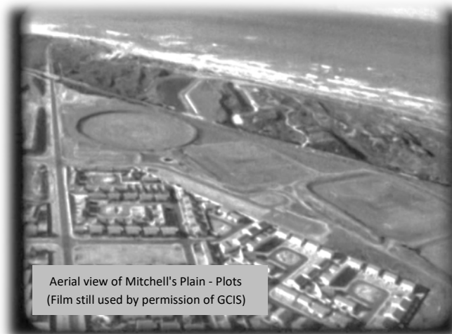
Aerial view of Mitchell's Plain - Plots

The Western Cape Archives holds the memory of our province with more than 45kms of records. This flyer will help you identify some of the main sources of historical information available to researchers in the Western Cape Archives, specifically on Mitchells Plain. It is not a complete list but a good starting point.