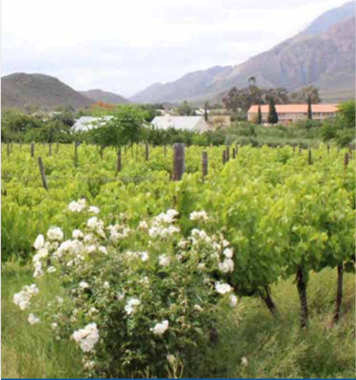
I-CAPE WINELANDS NASENDELENI ENGAKWIMYUZIYAM YEWEST COAST