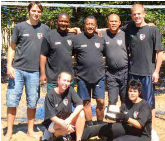
LEFT: THE RUNNERS UP: THE HR TEAM, WHO REPRESENTED ARGENTINA, FINISHED IN SECOND PLACE.