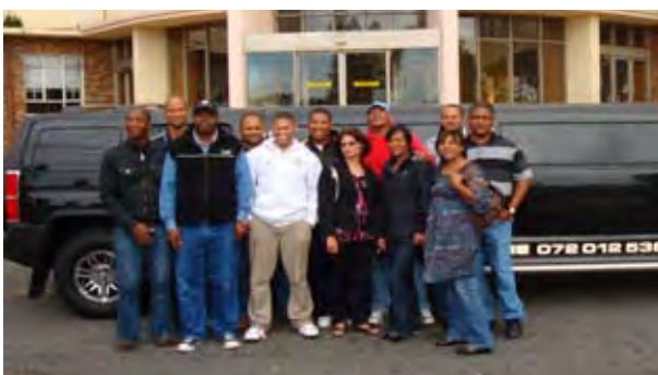
THE WINNERS OF THE EASTA FEVA SOCCA CHALLENGE WON A LIMO DRIVE AS FIRST PRIZE. THANK YOU TO LIMO EXTREME.