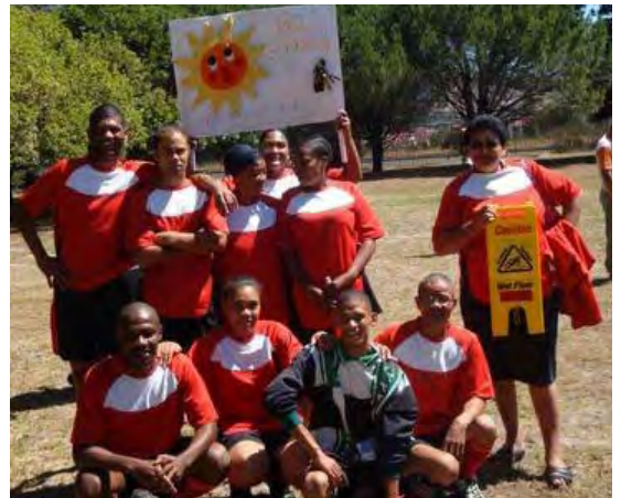
RIGHT: THE BEST SUPPORTERS PRIZE WAS SNAPPED UP BY MEDI GUARD.