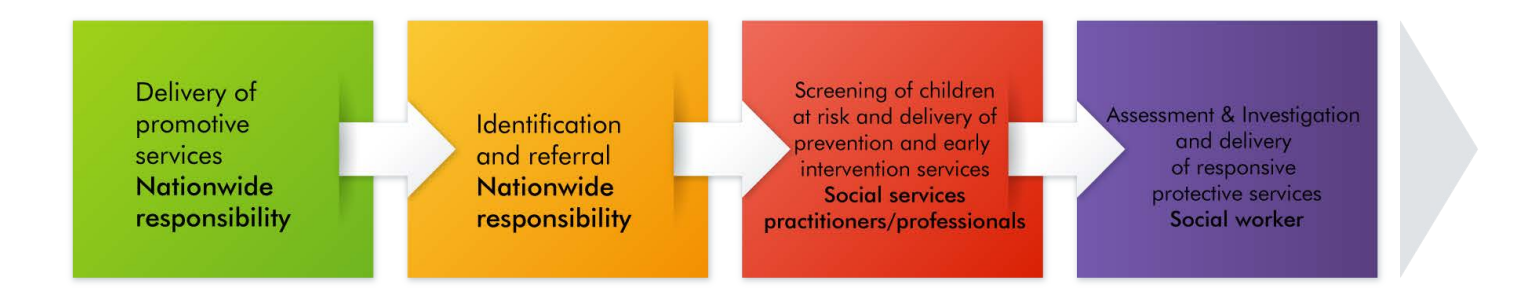
Figure 2: Continuum of surveillance responsibilities: from screening to investigation

Figure 2 depicts the increasing intensity of the surveillance and support required across the care and protection continuum which is the basis of this Policy.