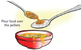
Pour food over the pellets

1. Pour pellets onto a teaspoon , then pour food over pellets