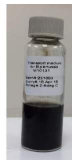
Figure 2B. Regan-Lowe semi-solid transport medium