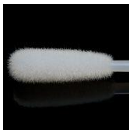
Figure 2A. Flocked swab

For PCR only: swabs should be placed in universal transport medium (UTM) immediately and transported at 2-8°C within 48 hours, to the microbiology laboratory.