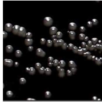
Figure 3. B. pertussis on Regan-Lowe charcoal agar