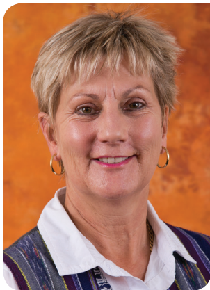
Anroux Marais Minister of Cultural Affairs and Sport Western Cape Government

In closing, a special word of thanks to all the DCAS team players for your hard work, dedication and professionalism in making the Sports Awards a proud occasion.