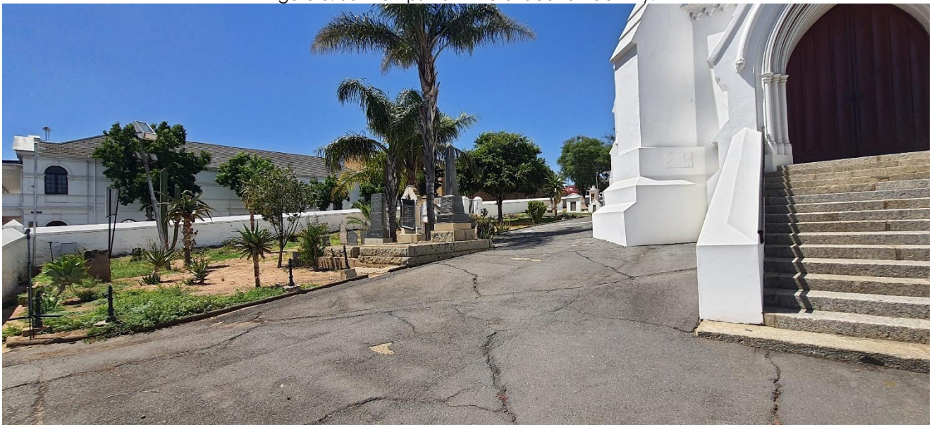
Figure 4. Proposed location for the reburial location.