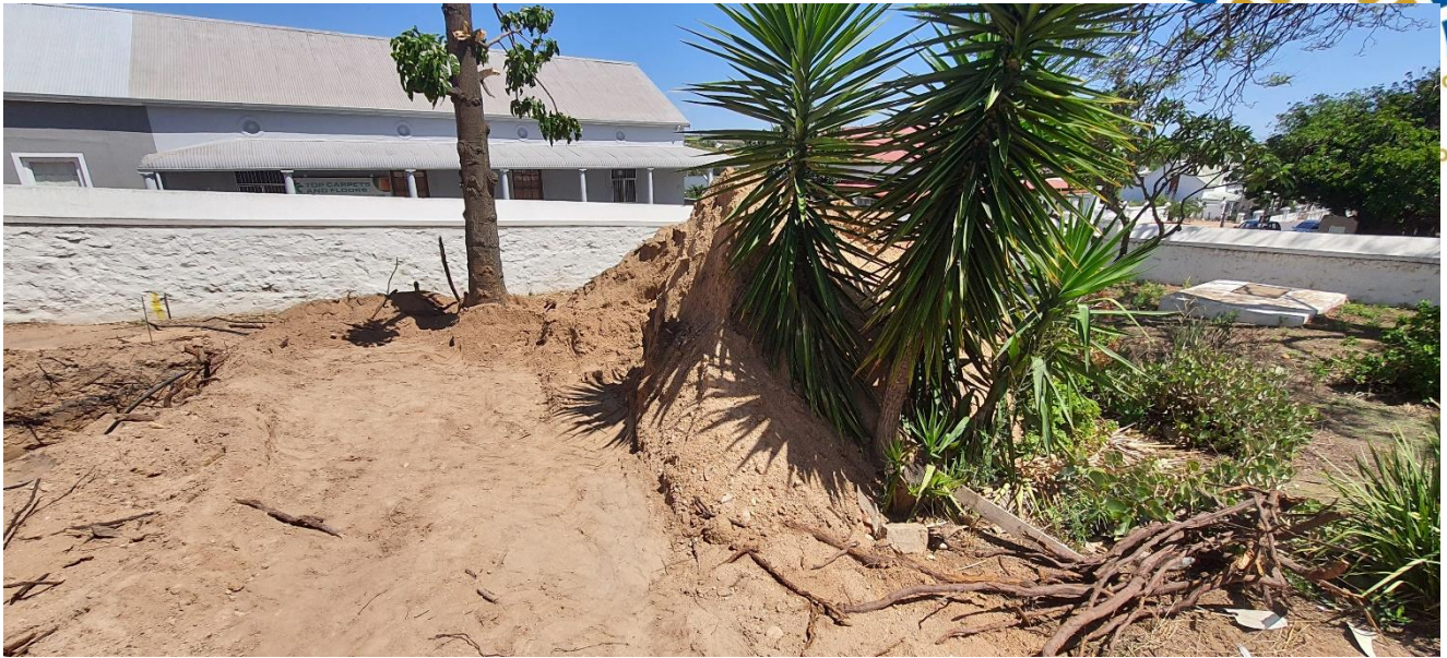
Figure 3. Soil humps from the excavation activity.