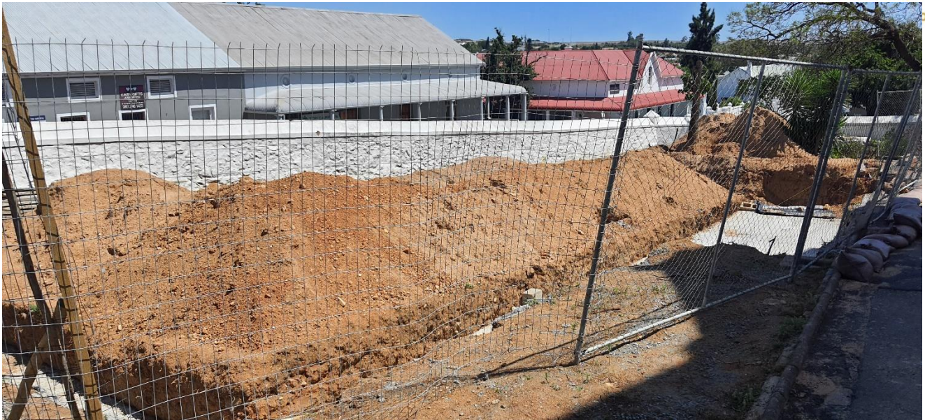
Figure 1. Trench for new foundation of the church hall