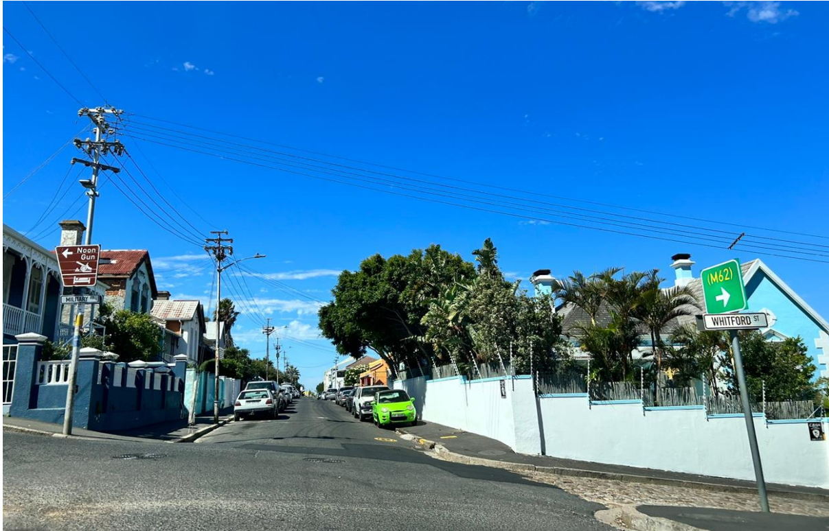
Figure 9. Streetview c/o site located on Whitford and

ILifa leMveli leNtshona Koloni Erfenis Wes-Kaap Heritage Western Cape