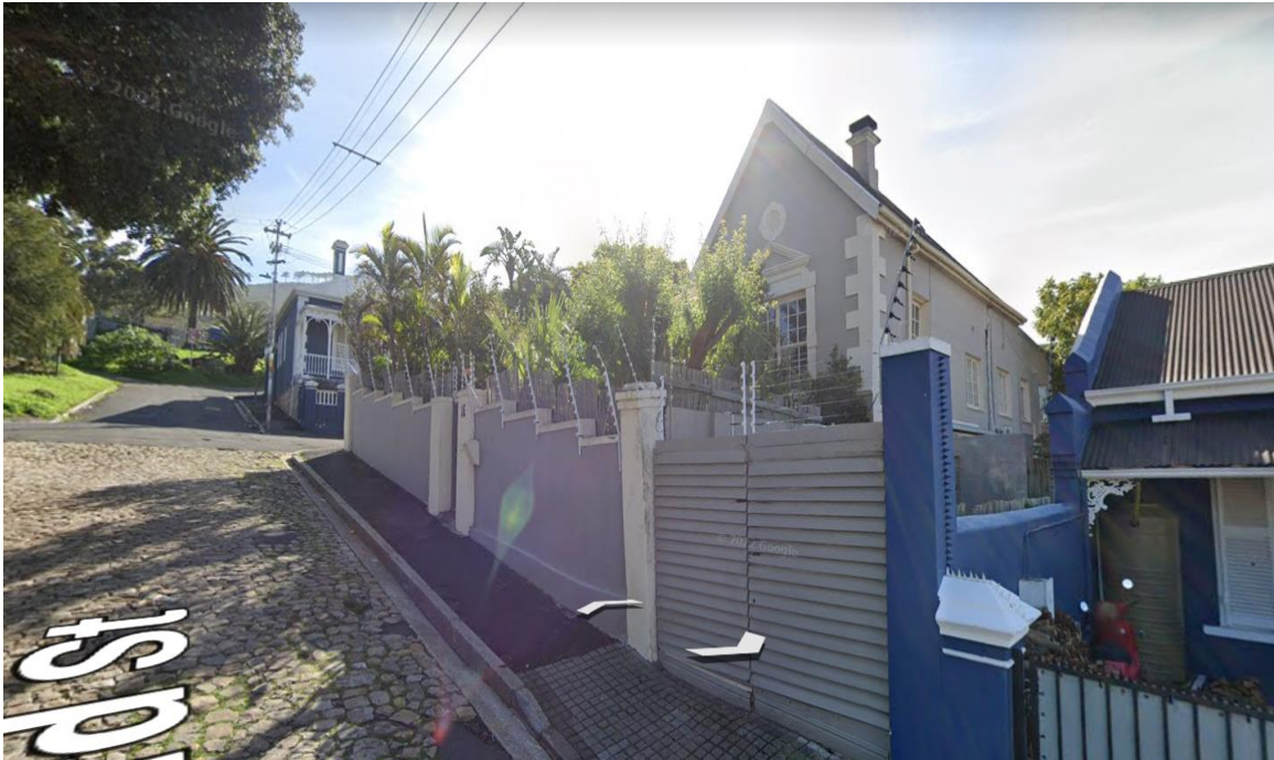
Figure 3. Google Earth image of garage door

ILifa leMveli leNtshona Koloni Erfenis Wes-Kaap Heritage Western Cape