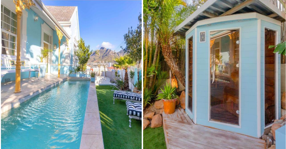
Figure 5,6,7,8 (below) extracted from the hotel website: