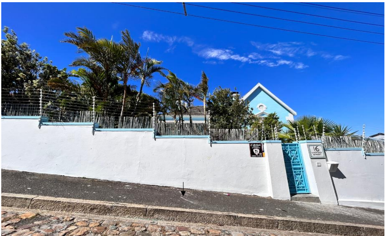
Figure 2. Front view of the property taken 11/01/2023 indicating paint work already completed.