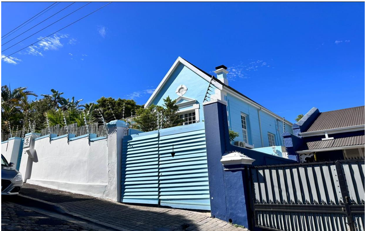
Figure 4. Unauthorised paint work to garage door.