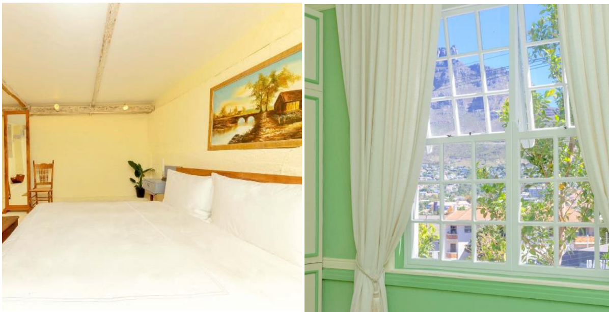
Images indicating internal and external completed work.