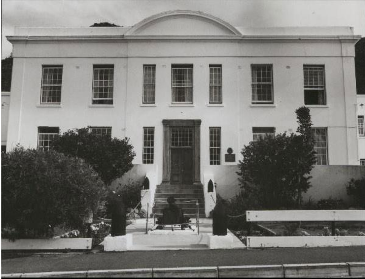
1988 image, Andre Pretorius Collection, Stellenbosch University - http://hdl.handle.net/10019.2/1352