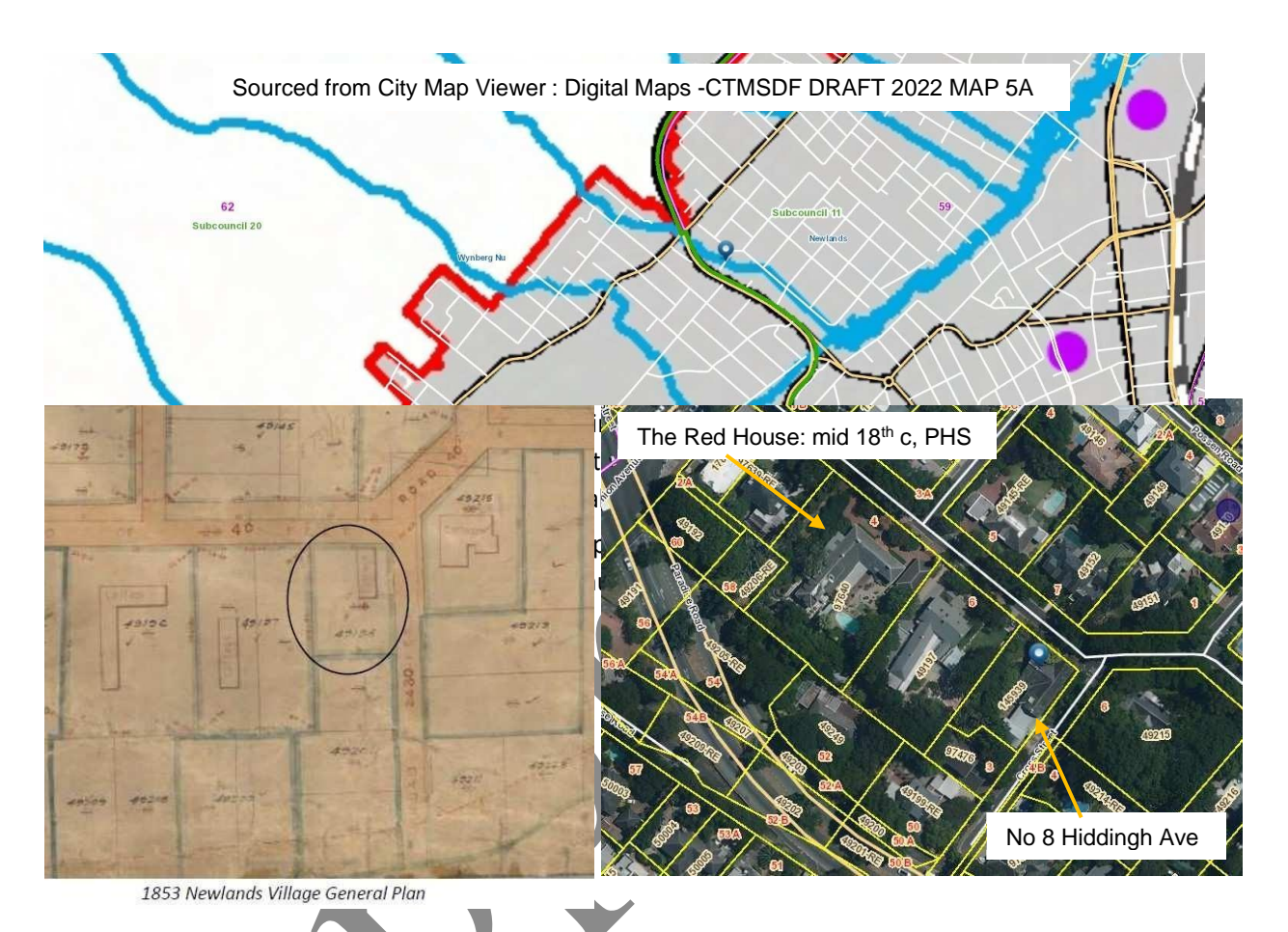
This points to the importance of the dwelling at No 8, and especially the partthat corresponds to the 1853 map, as having a high heritage significance.